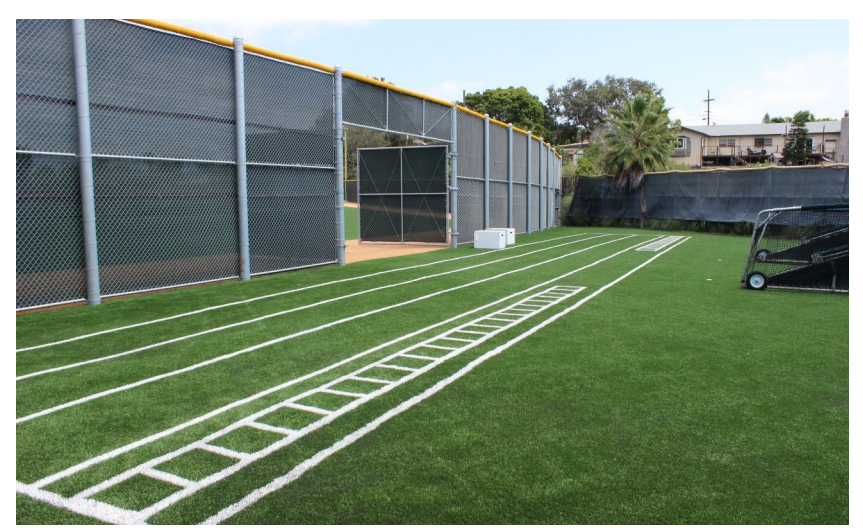
Small practice/storage area with agility drills striping