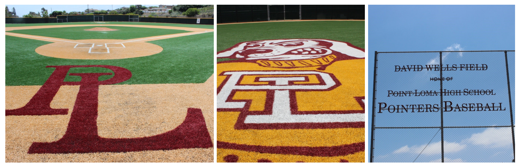
Infield and custom Point Loma HS logo