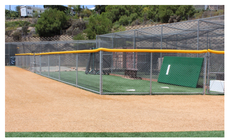
Bull pen adjacent to right field