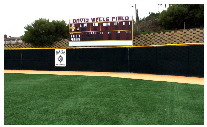
Outfield windscreen and scoreboard