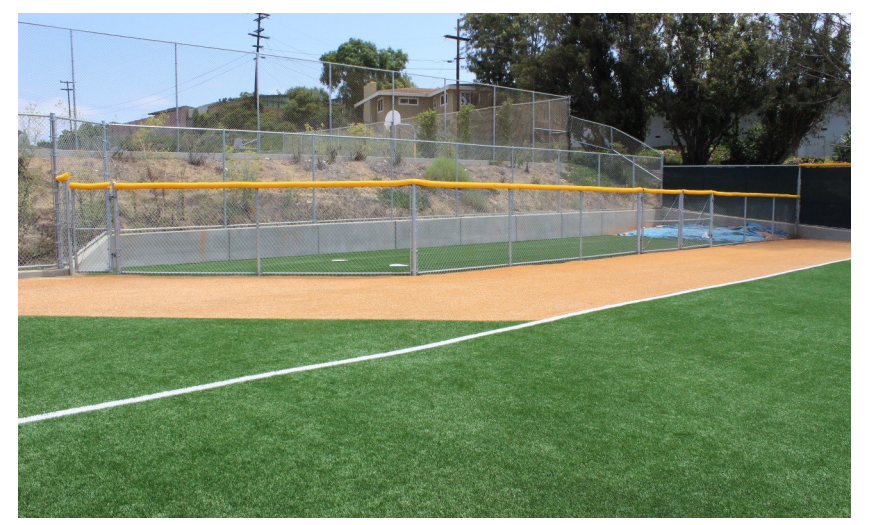
Bull pen adjacent to left field