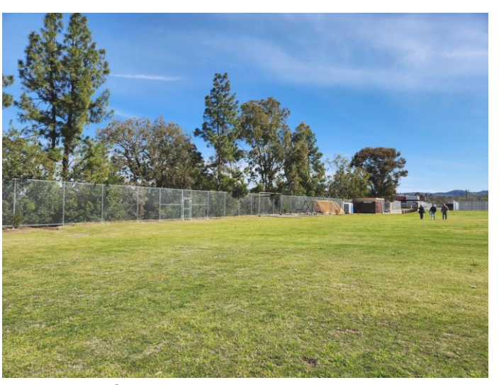
NE View of Existing Joint-Use Field Existing Joint-Use Tennis Courts