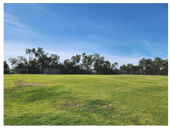
SW View of Existing Joint-Use Field Existing Joint-Use Tennis Courts