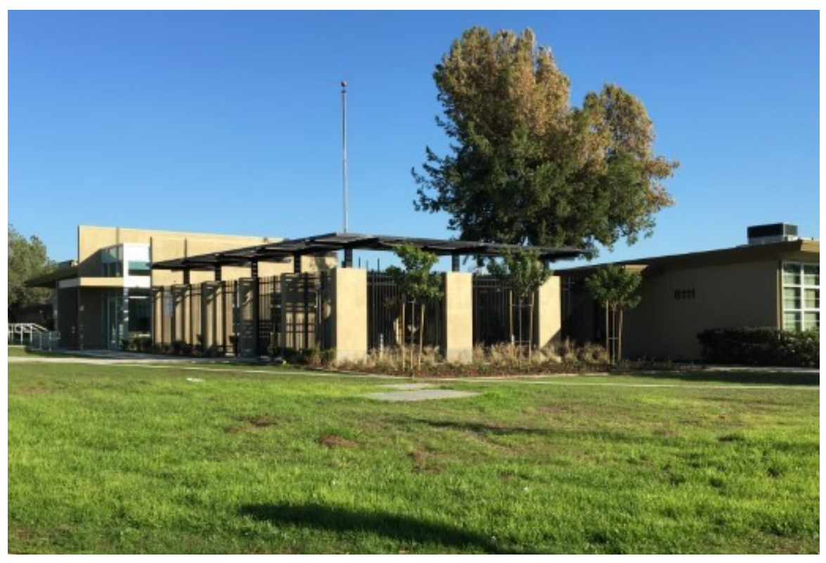
New entry courtyard to campus