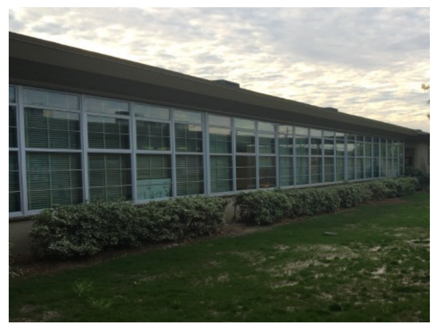
Example of new windows