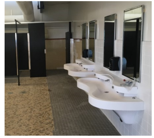
New bathroom fixtures