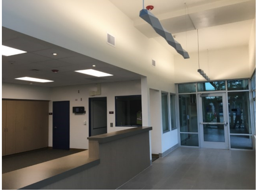
New entrance to expanded administration office