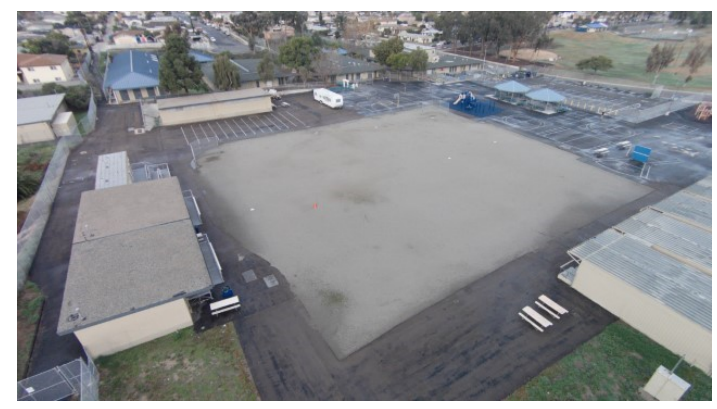
Pre-installation dirt field

The field features two soccer fields and a small scale Baseball diamond with permanent backstop, running track, and irrigation for cooling and cleaning purposes.