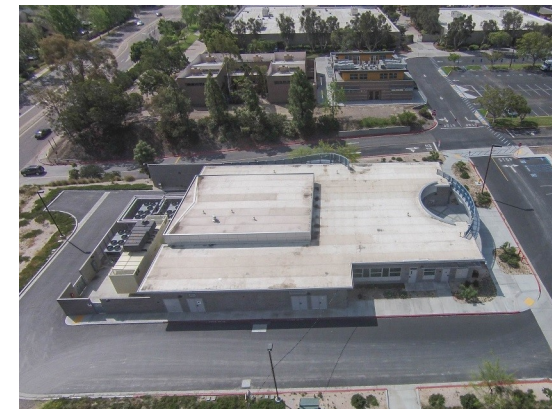
Aerial of facility