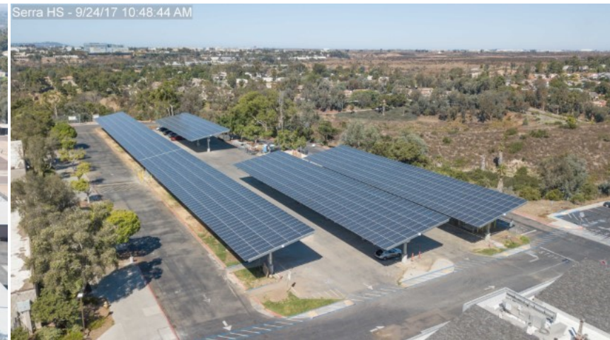
Solar canopies at North parking lot