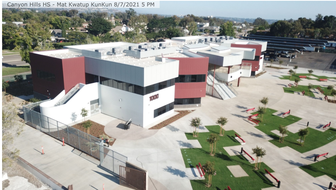
New Classroom Building

This project includes the design and construction of a new two-story classroom building on the southeast side of the campus, directly south of the existing Administration Building 100 and visible from Santo Road. Additionally, the project scope will include the replacement of a large portion of the existing underground storm drain and site concrete throughout the center of campus and removal of existing modular classroom structures.