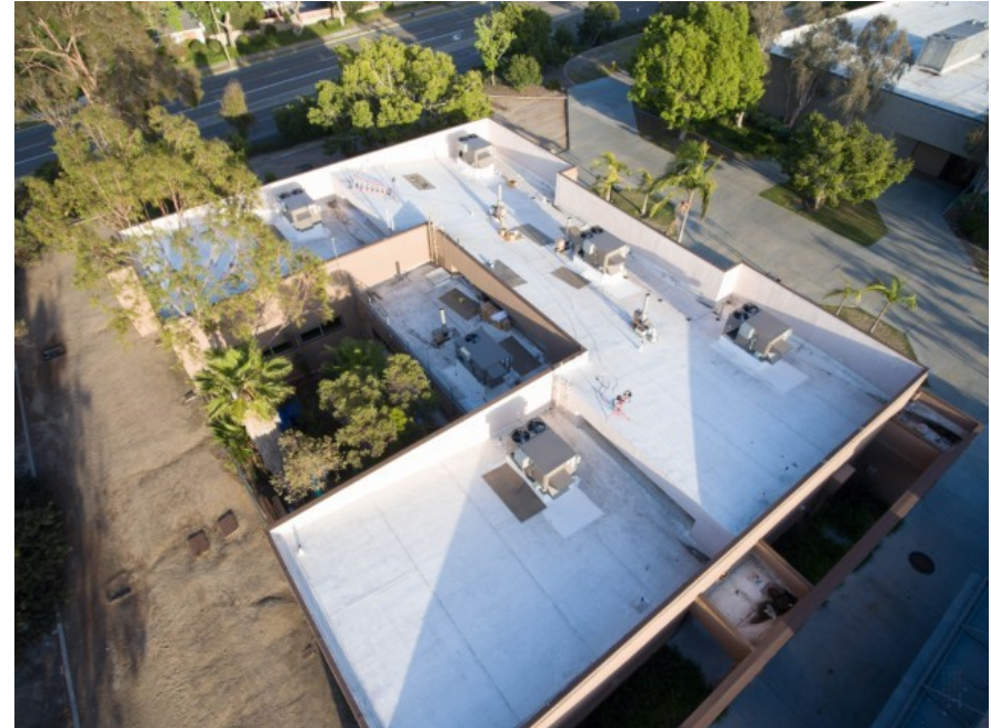
New energy efficient HVAC roof top units

This project at Canyon Hills High School replaces six heating units that were nearing the end of their useful life with new energy-efficient package heating/ventilation/air conditioning (HVAC) units that will provide both heat and air conditioning to five science classrooms and a prep room.