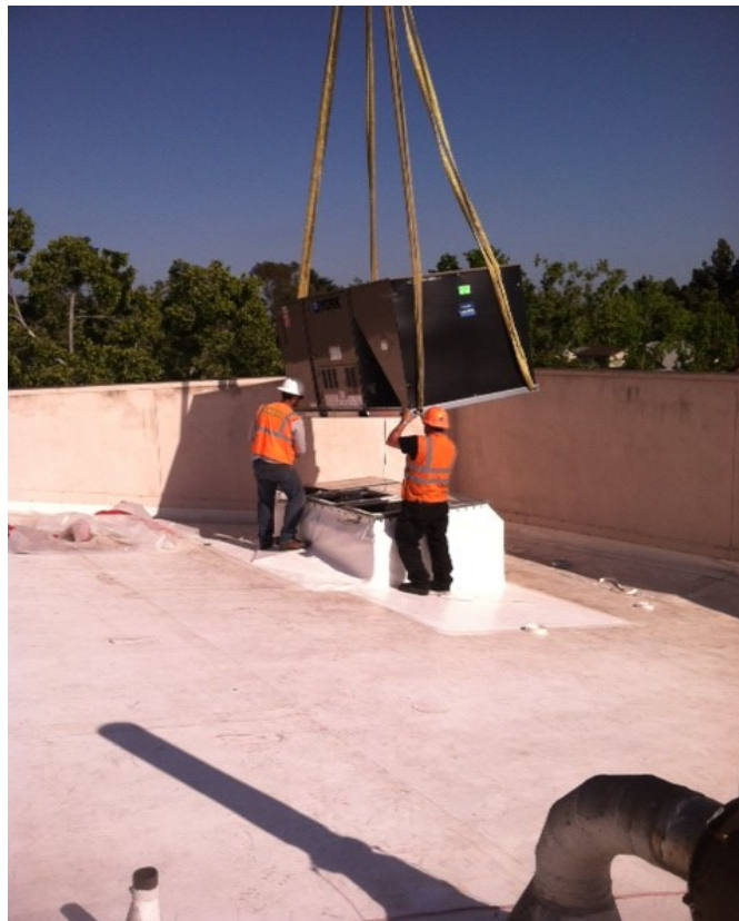
New HVAC units crane delivered on roof