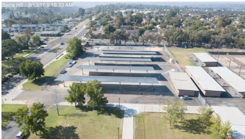
Solar canopies at South parking lot