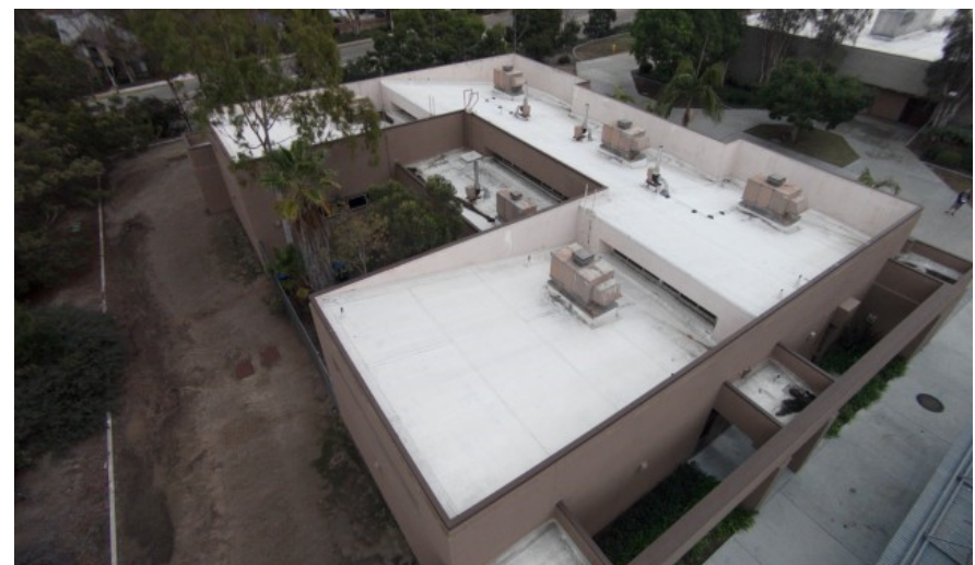
Older heating units