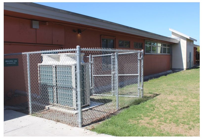
Air conditioning unit and mechanical housing