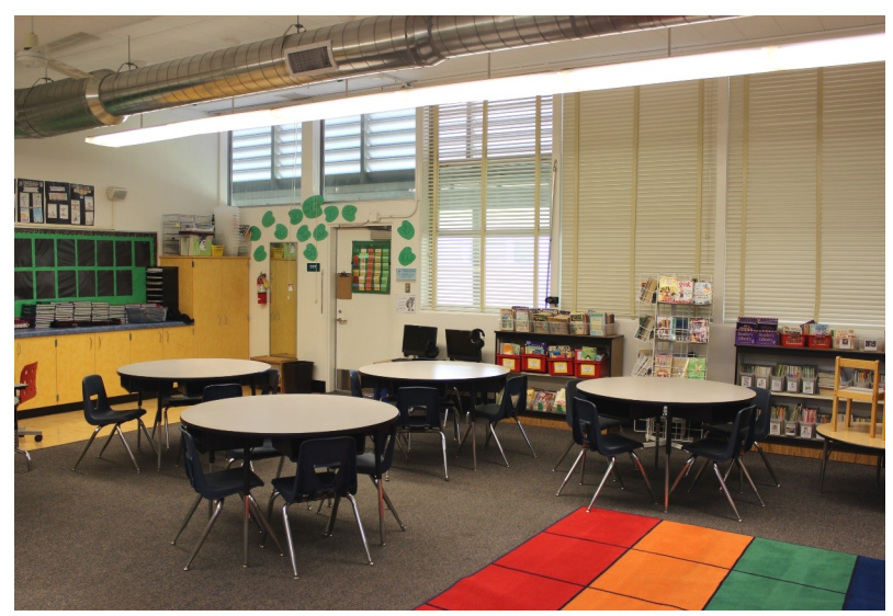
Example of a remodeled third grade classroom