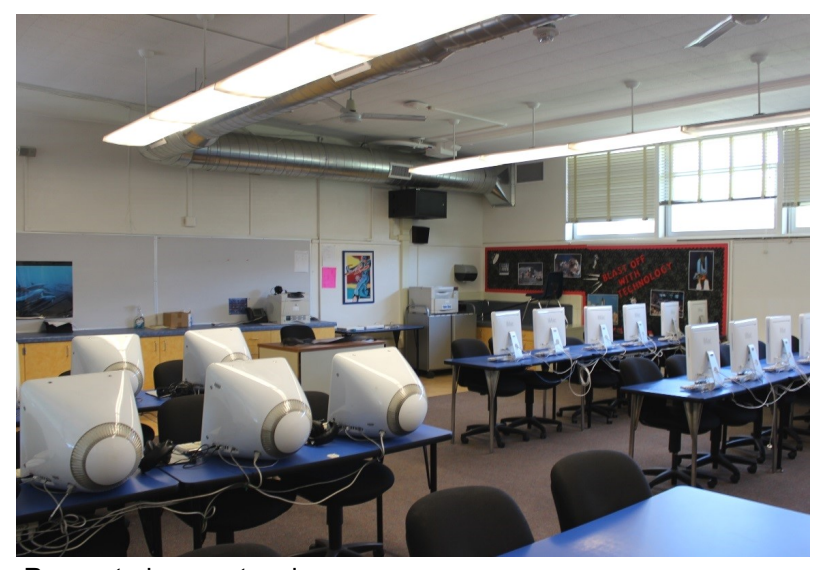
Renovated computer classroom