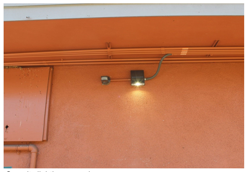
Security lighting upgrades