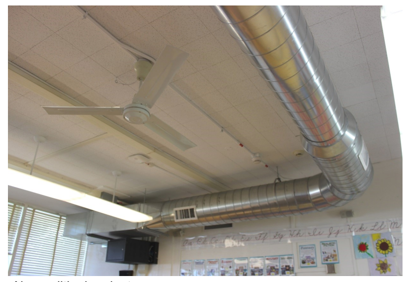
Air conditioning ducts