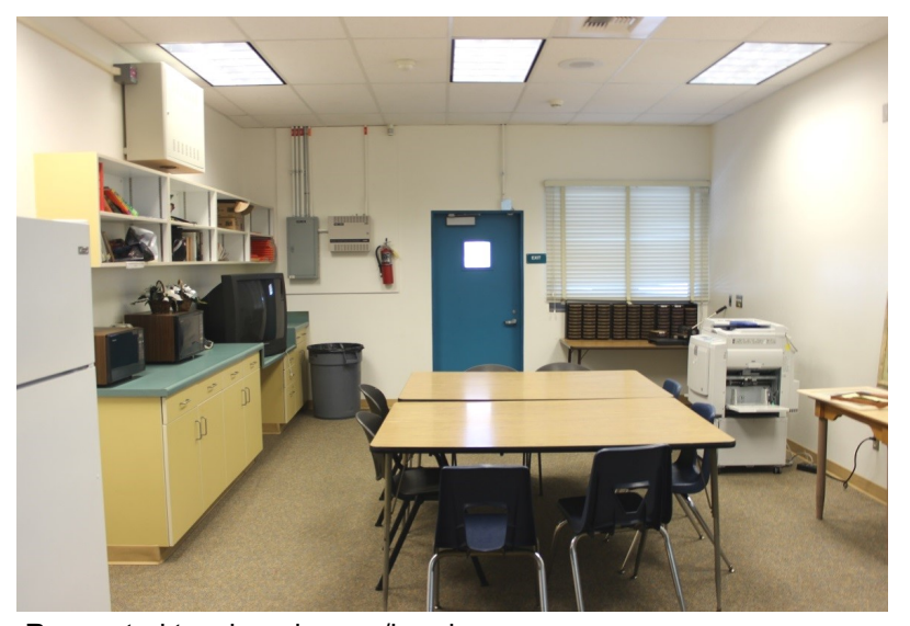
Renovated teachers lounge/break room