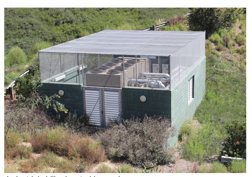
Industrial chiller located in nearby canyon