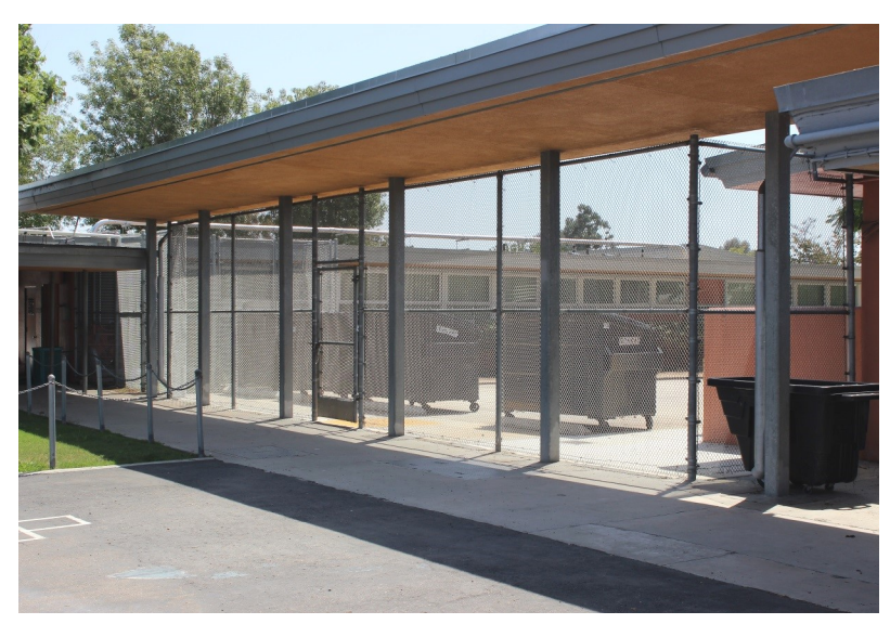
Security fencing upgrades near dumpster area