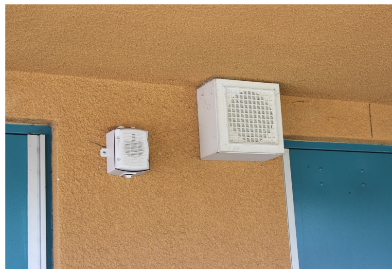
Updated PA system