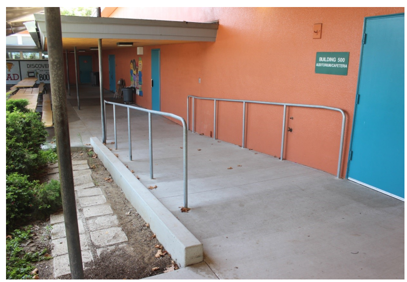
ADA ramp leading to lunch court