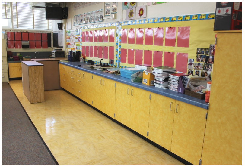
Newly installed classroom cabinetry