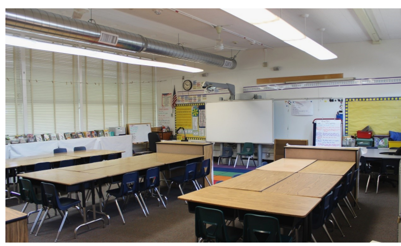
Renovated classrooms feature new carpeting, paint, and air conditioning upgrades

Completed: March 2015 Funding: Proposition S