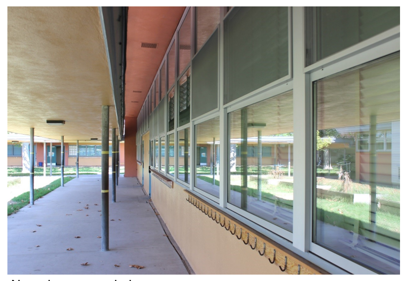
New classroom windows