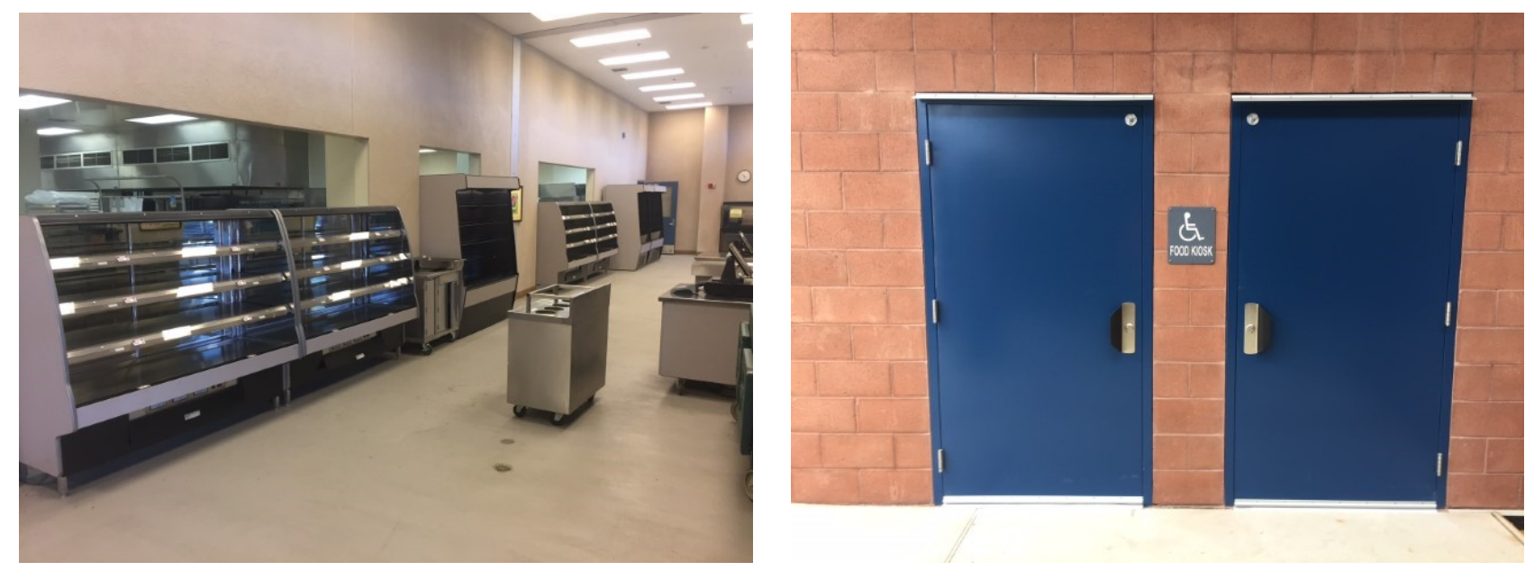
Renovated Food Service