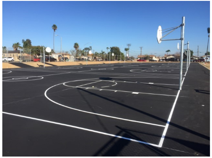
Resurfaced Basketball Courts