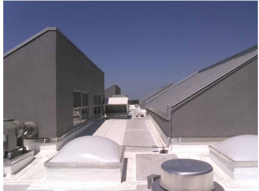
New roofing material and HVAC equipment installed