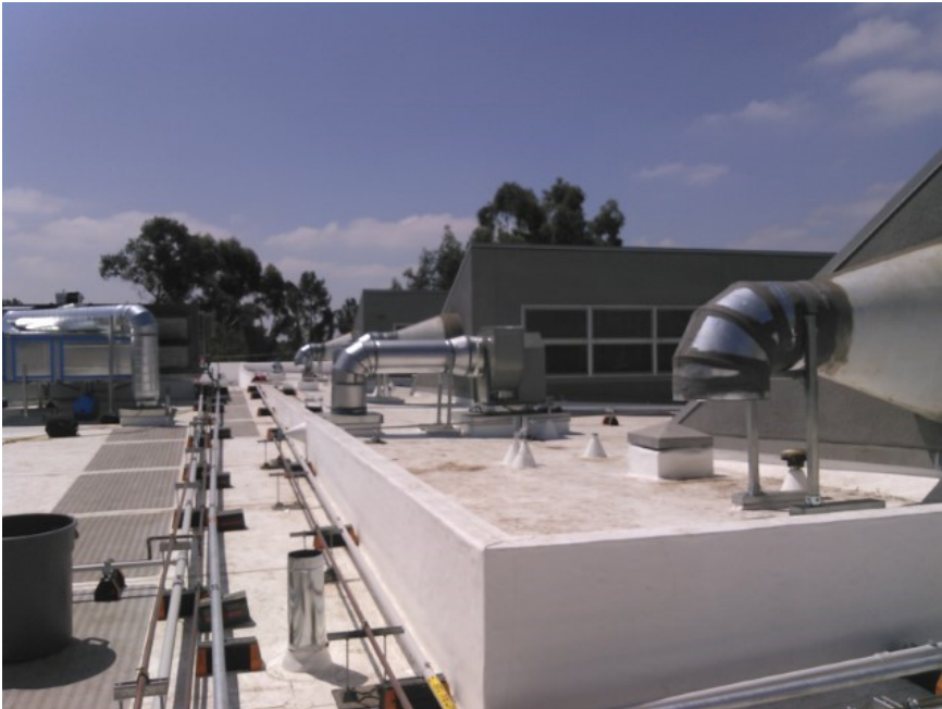
New roofing material and HVAC equipment installed

The roofing and heating/ventilating/air conditioning (HVAC) replacement project at De Portola was due to the age of the roof and systems. These repairs and renovations will support the learning environment for the students and comply with the district's health and safety standards