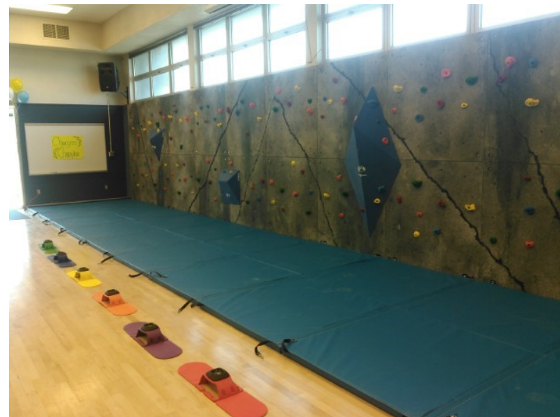
New roofing material and HVAC equipment installed