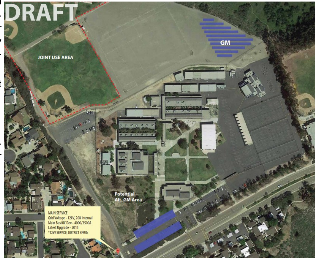
Proposed solar array placement