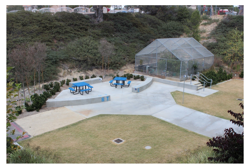
Garden enclosure and outdoor area