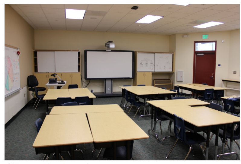
Classroom layout version two