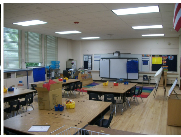
Renovated interior spaces