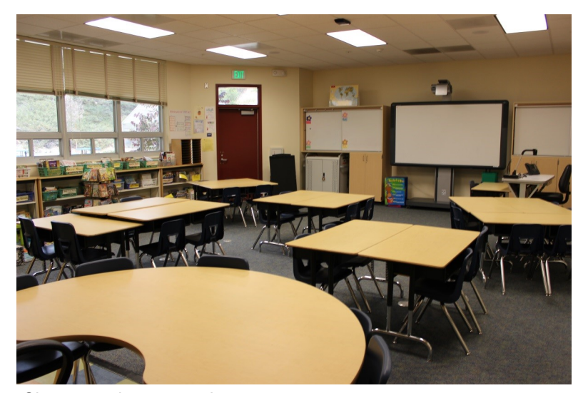
Classroom layout version one