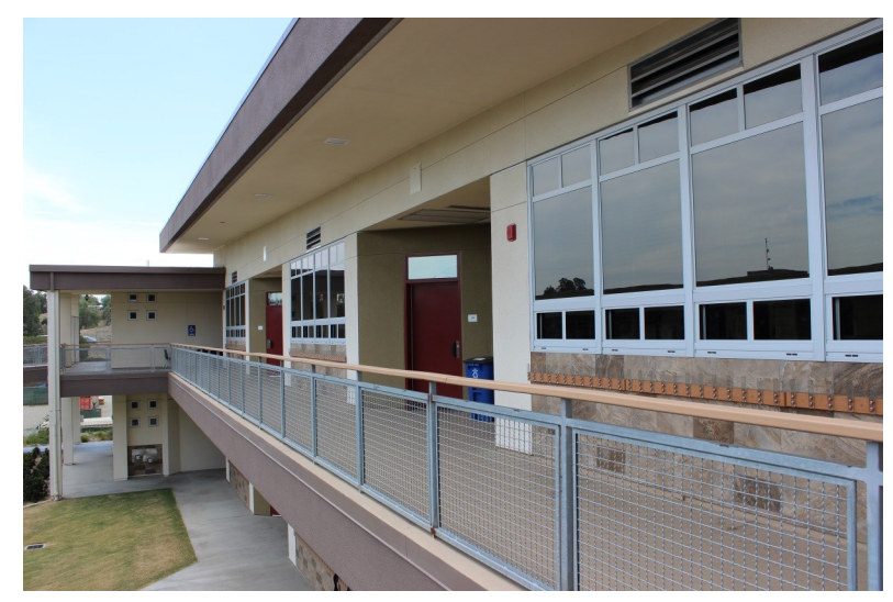
Second floor balcony, north facing