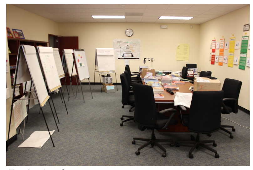
Teachers' conference room