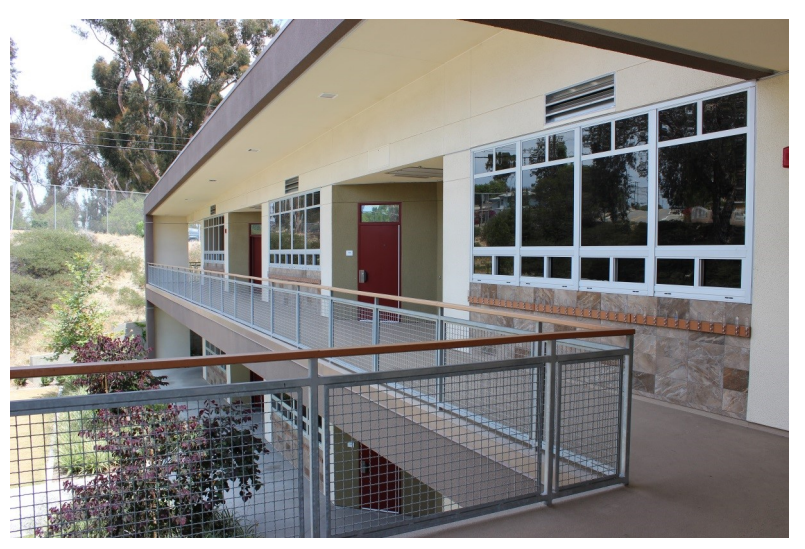
Second floor balcony, south facing