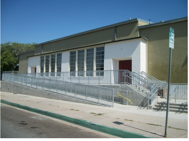
Renovated exterior spaces