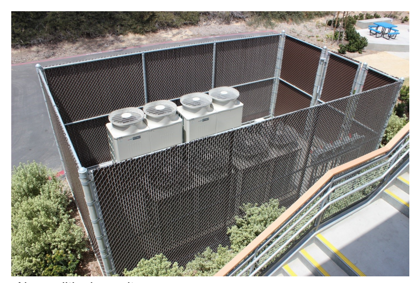
Air conditioning units