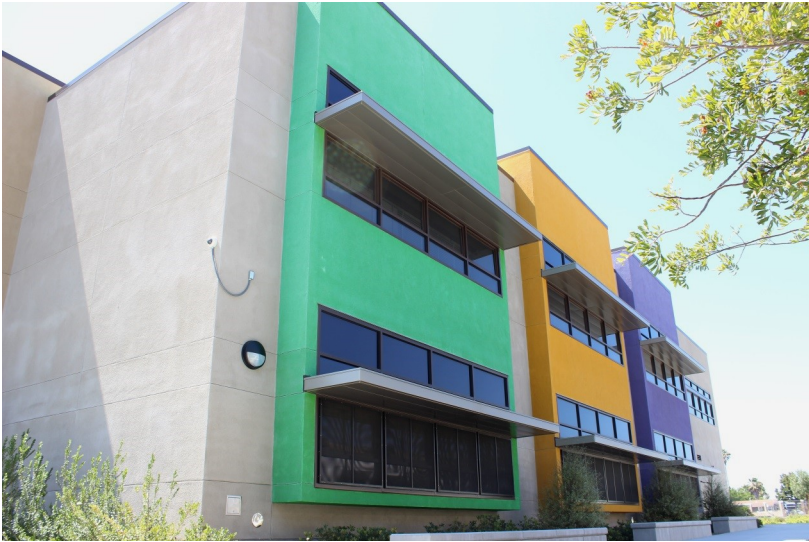
East side façade