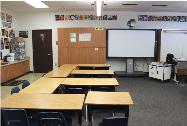
Fourth grade classroom layout