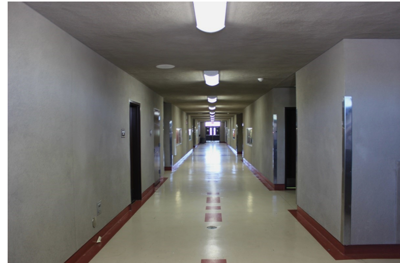
First floor hallway