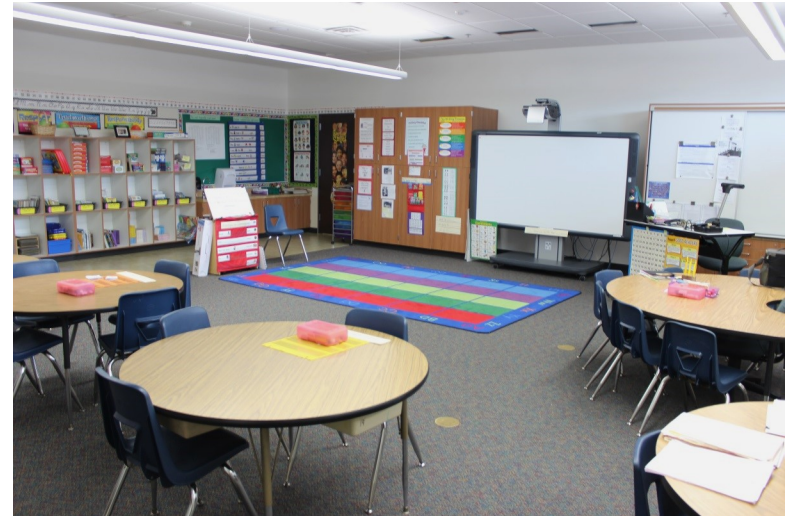
Third grade classroom layout