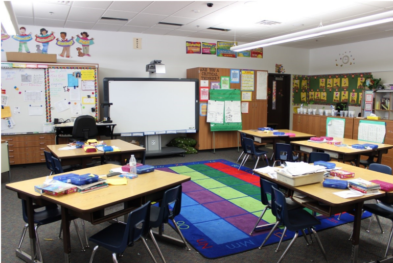
Third grade classroom layout