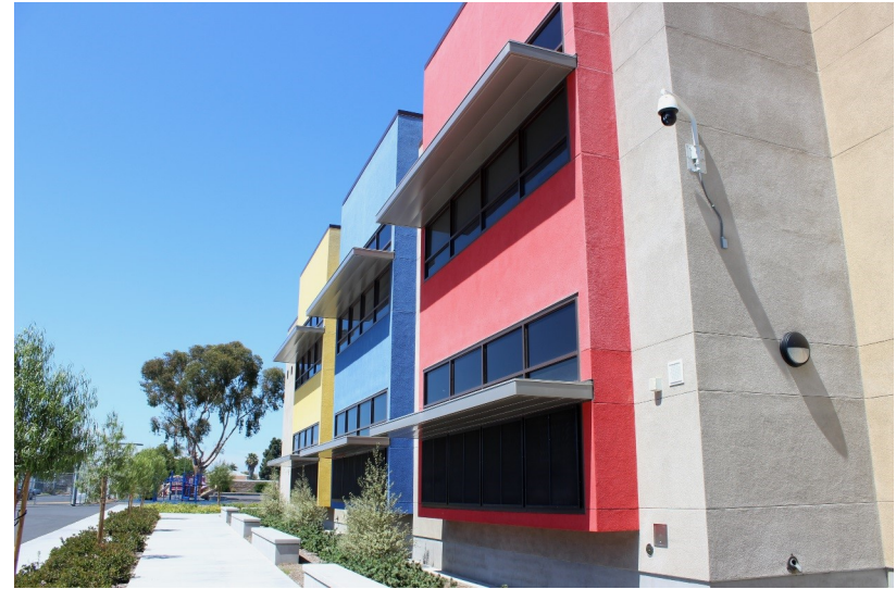
West side façade