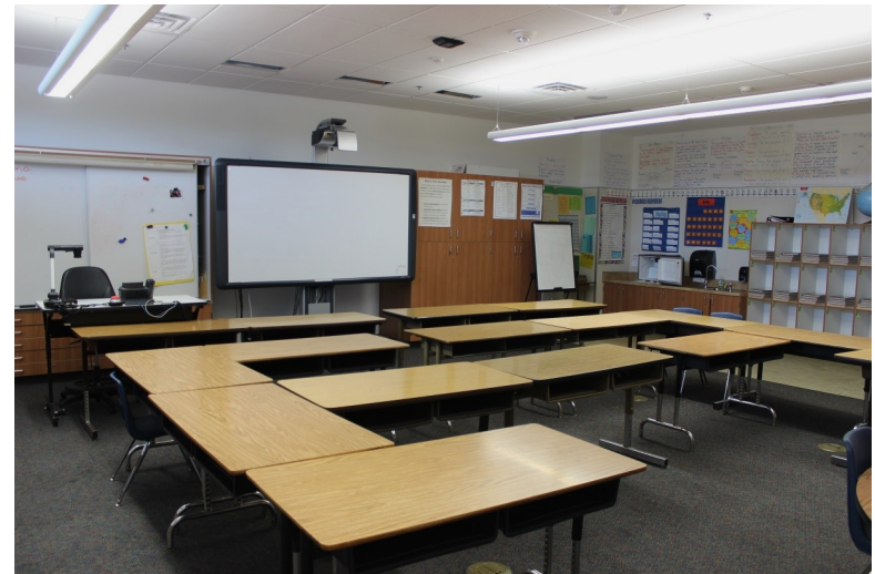
Fifth grade classroom layout