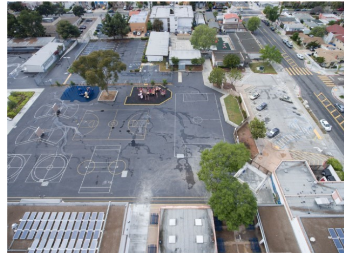
Pre-installation asphalt play field