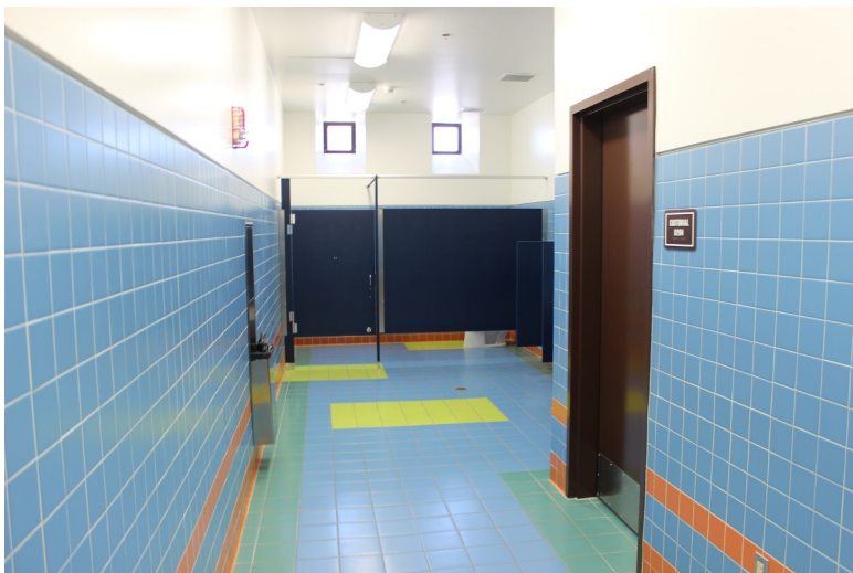
Second floor bathroom