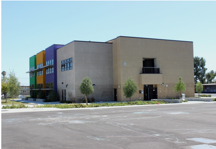
Front and eastern façade of new building