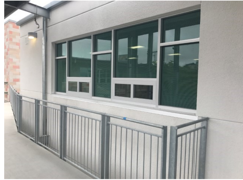
Exterior photos from the playground, building features and new parking lot with surrounding security fencing