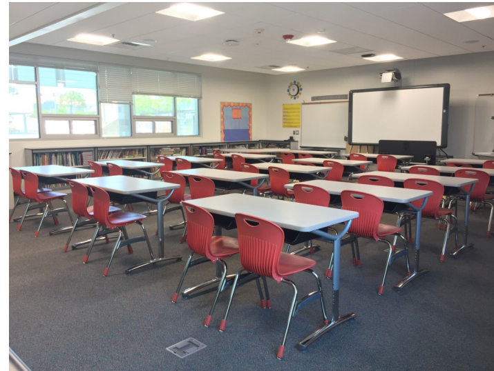
Example of upper grade classroom