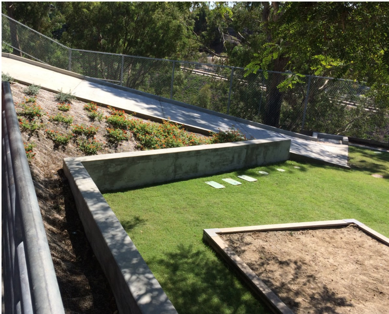
Repaired access ramp and new landscaping

A concrete access ramp to the Kindergarten classroom was repaired and/or replaced in conjunction with this plan. Minor landscape and irrigation improvements on parts of the slope took place as well.