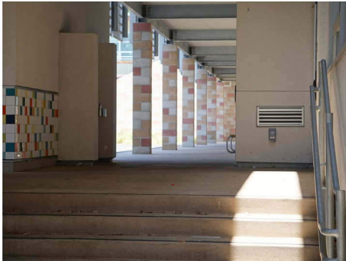
Corridor to classrooms