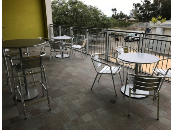
Balcony on second floor