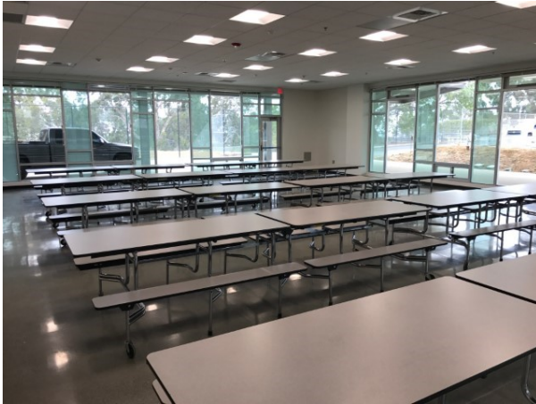
New Cafeteria on first floor