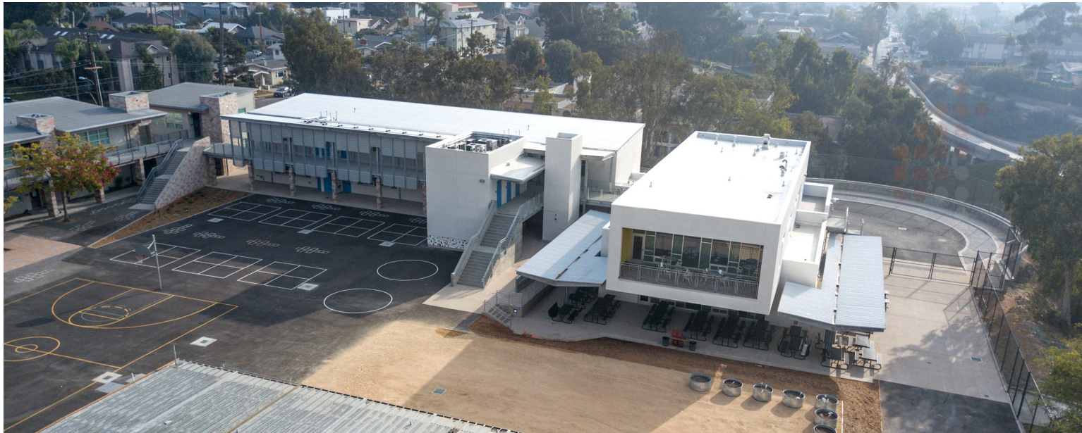
Exterior photos of completed project: Aerial, from the gecko garden, lunch court and second floor stair landing