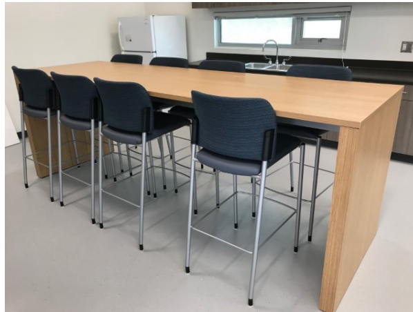
Teachers lounge furnishings