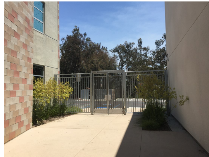
Security gate leading to new parking lot