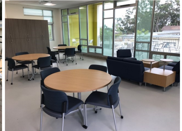
Teachers lounge on second floor