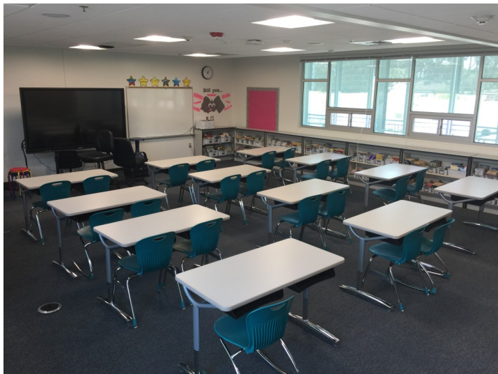
Example of primary classroom