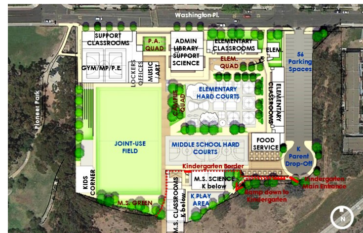
Site plan of Whole Site Modernization Phases I-IV