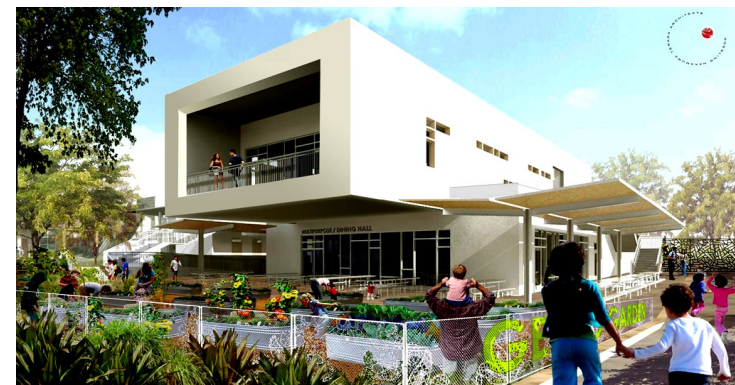
Rendering of new two-story multipurpose and cafeteria