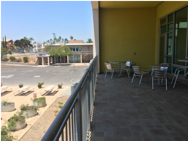
Balcony overlooking gecko garden