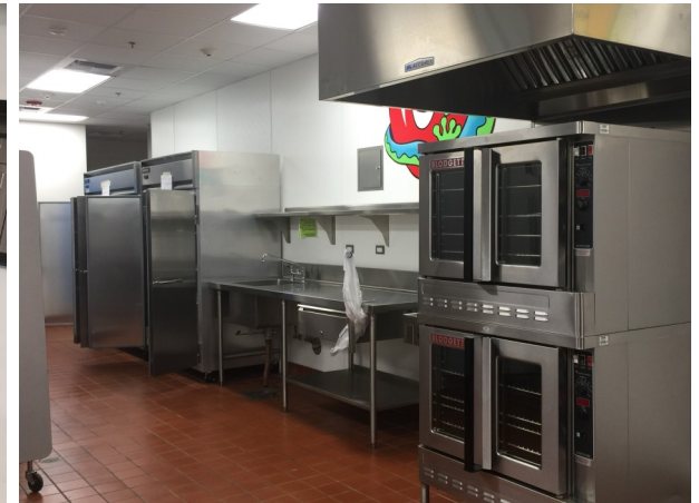
New Food Services on first floor