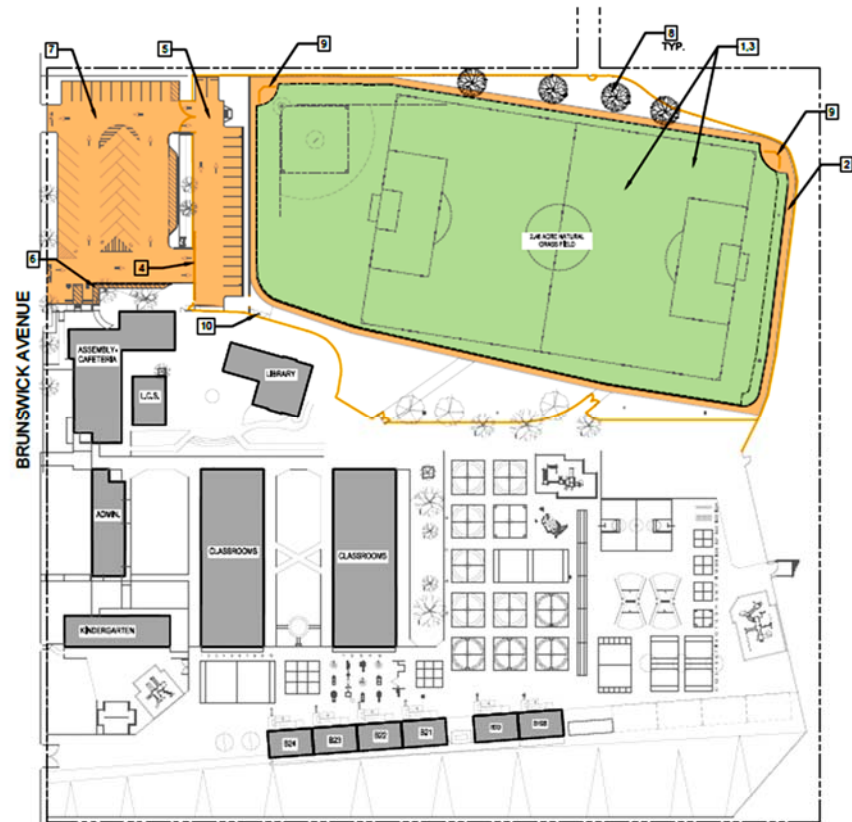
Site Plan for the new Joint Use Field