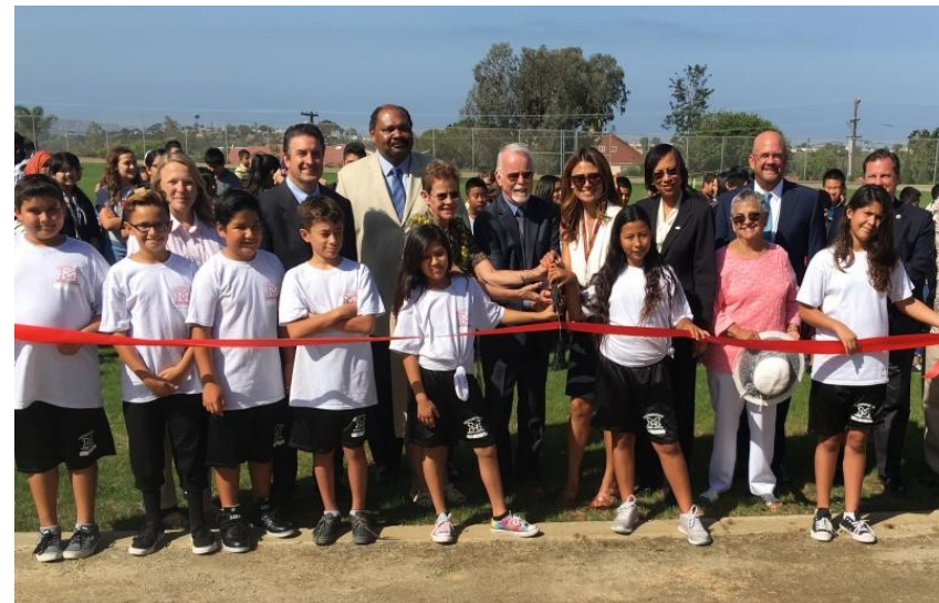
Ribbon Cutting ceremony on opening day