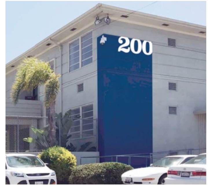
Renderings of exterior paint and graphics