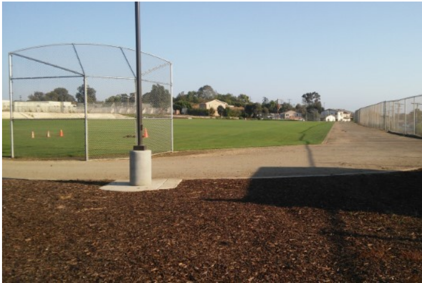
Track that surrounds the new turf field