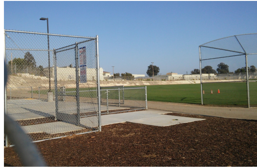
New secure community entry to the field and accessible parking