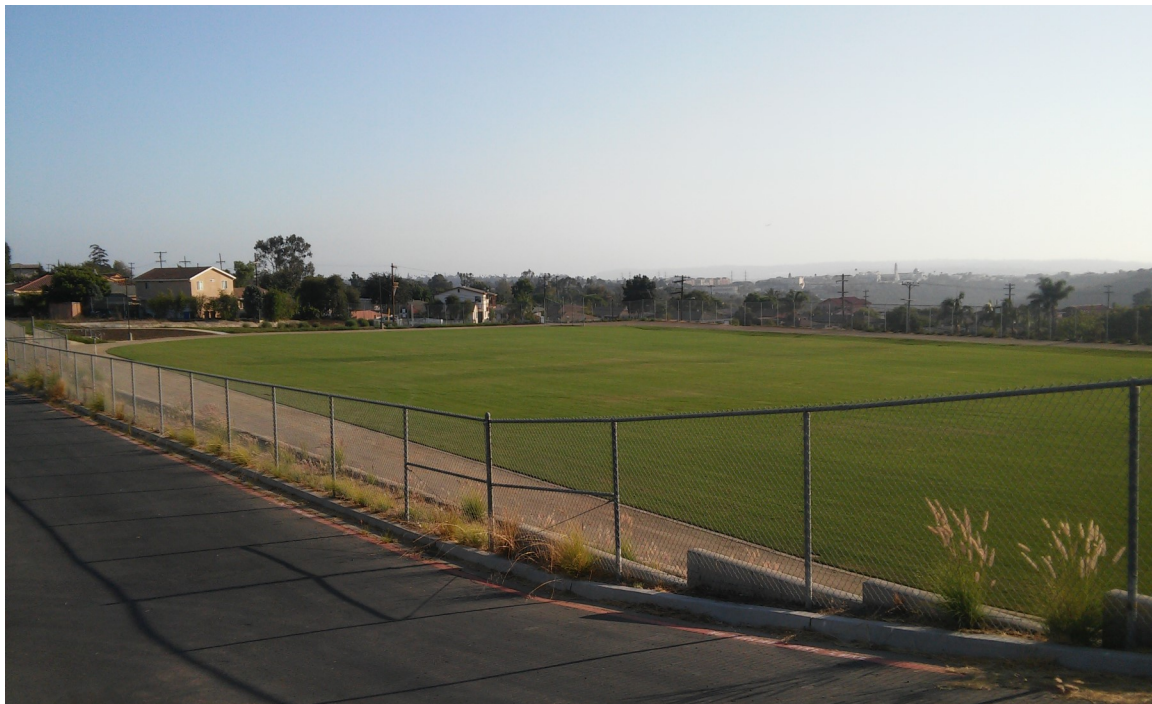
New natural turf field

This Joint Use Agreement (JUA) project with the City of San Diego involves the construction of a Full Amenities Park by the City on the schools lower level existing Decomposed Granite (DG) Field. The agreement allows the park to be used by the students during school hours and open as a public park to the community after school, on weekends and during school breaks. In addition to the field, the District made improvements to the existing Physical Education Building's restrooms.