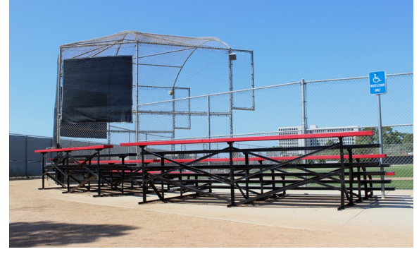
Batting cage and bleachers