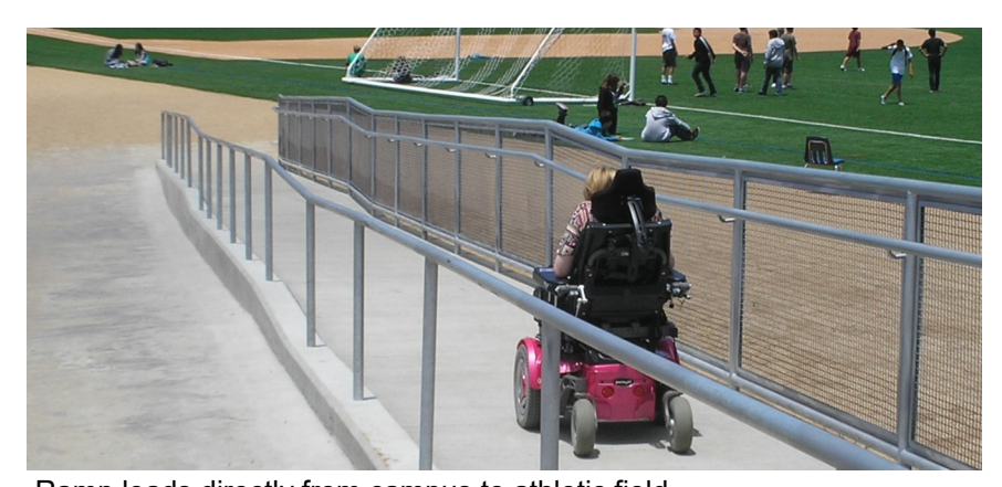
Ramp leads directly from campus to athletic field