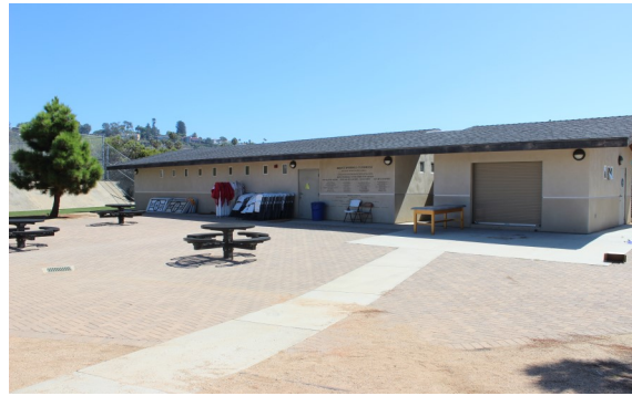
Multipurpose building and picnic area