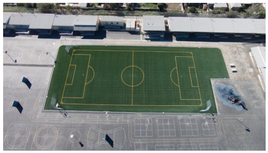
Aerial of the new synthetic turf field