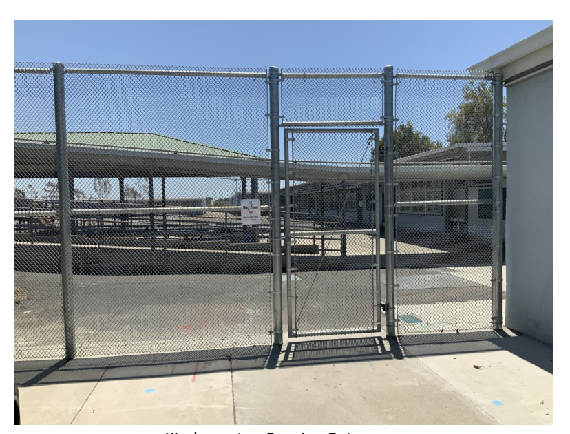
Kindergarten Fencing Entry