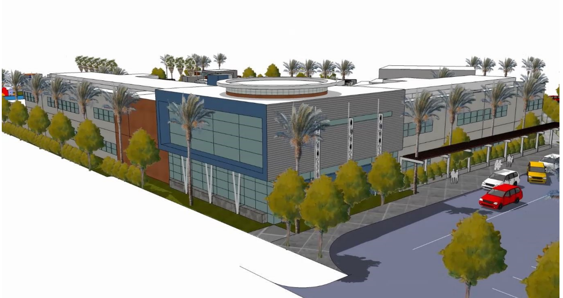
New Classroom Building Rendering