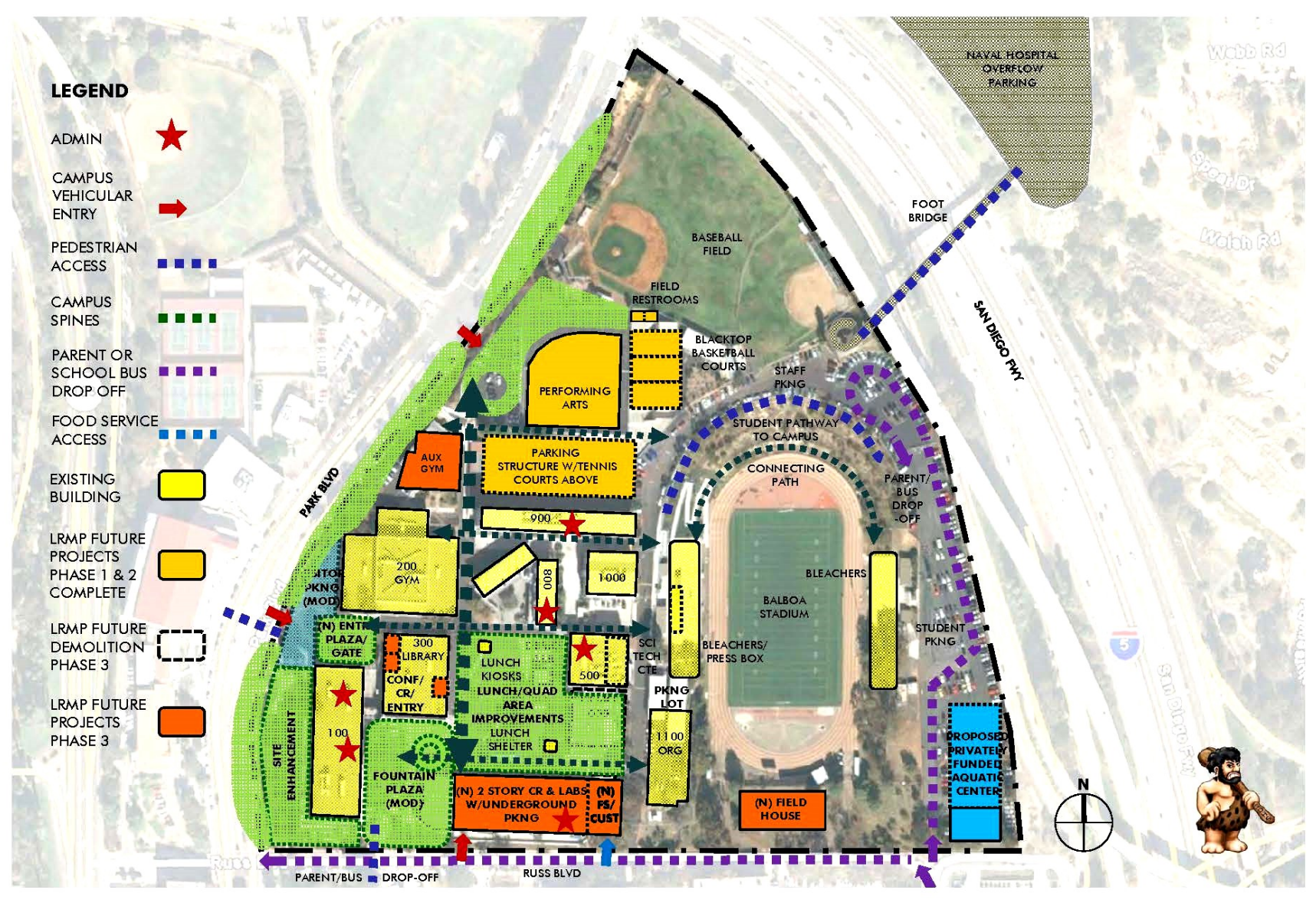
Proposed Site Plan for Whole Site Modernization