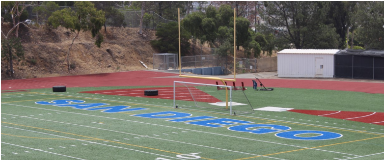
Southern endzone and shot put areas

San Diego High's existing dirt track and natural grass field were replaced with an all-weather rubberized track and synthetic turf field that supports football, lacrosse, field hockey, and soccer. Additional improvements included grading and field drainage. The field was upgraded in 2014 as part of a warranty replacement and now features the school's updated Cavers logo at midfield.