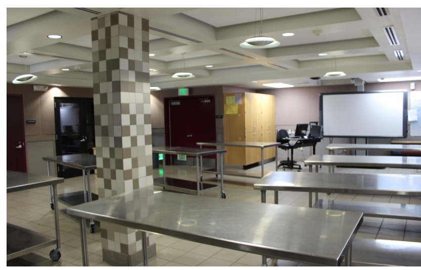
Preparation area/classroom and instructor lecture area