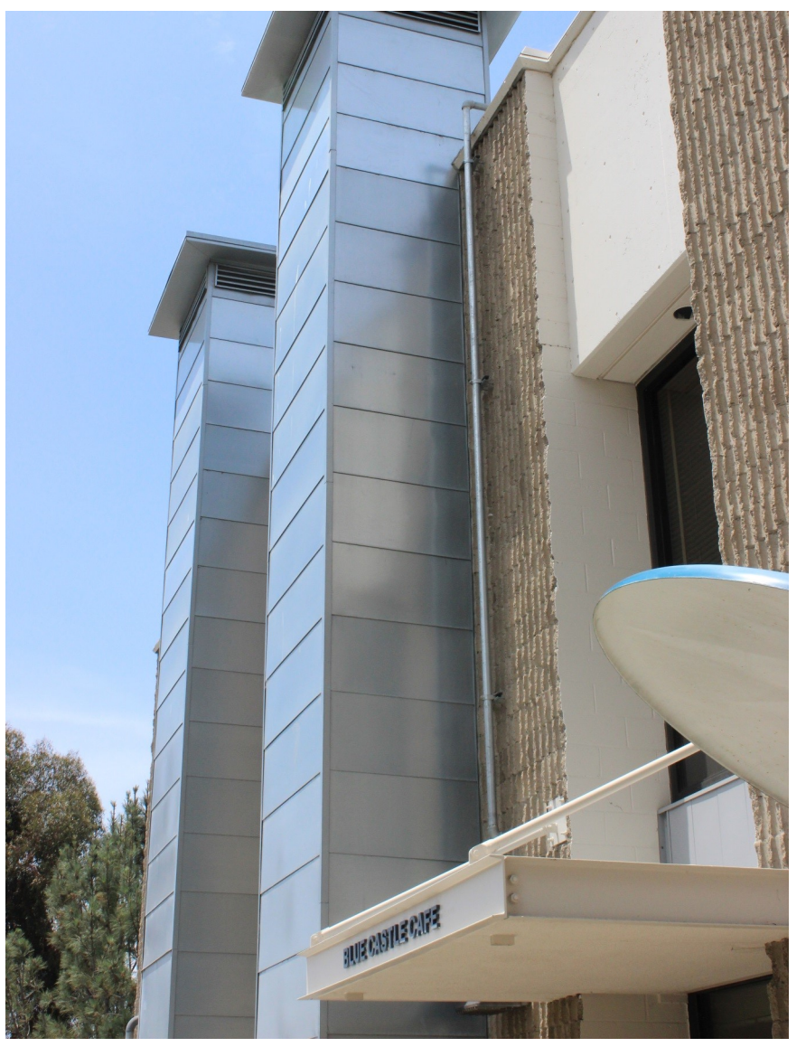
Culinary arts entrance and stainless steel vents