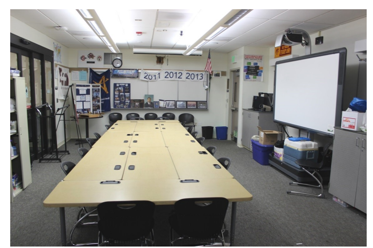
One of two classrooms