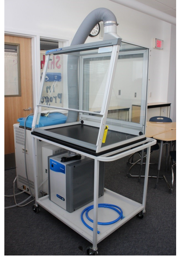
Portable fume hood