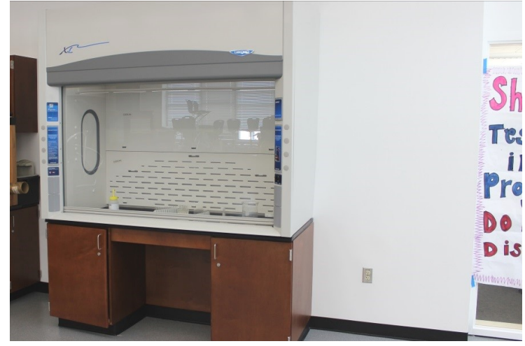
Laboratory fume hood