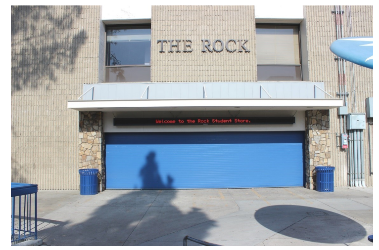
The Rock student store exterior