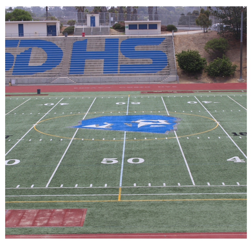
Updated San Diego High logo now featured at midfield