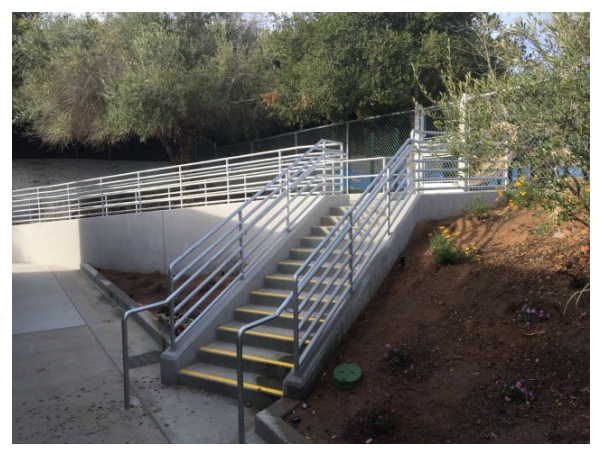
New stairs to Kindergarten building