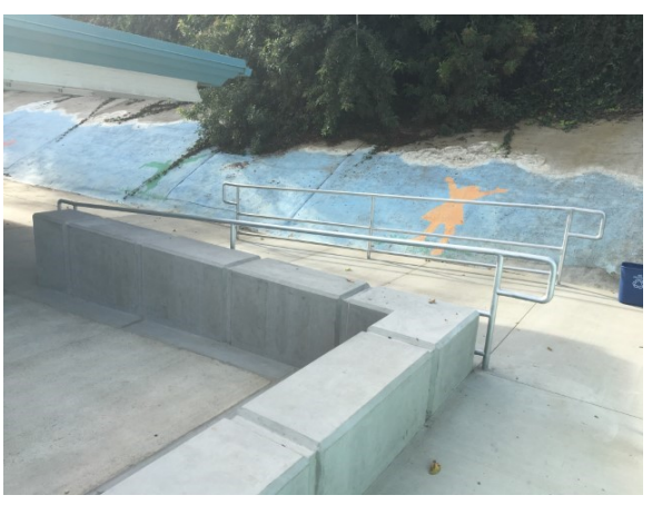
New concrete wall with ramp and railings