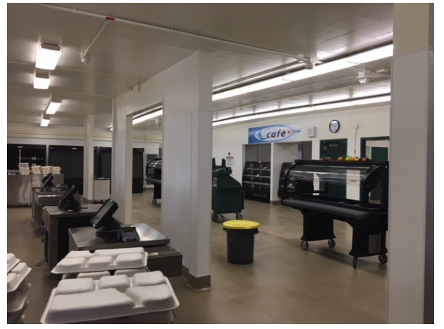
Updated food services equipment