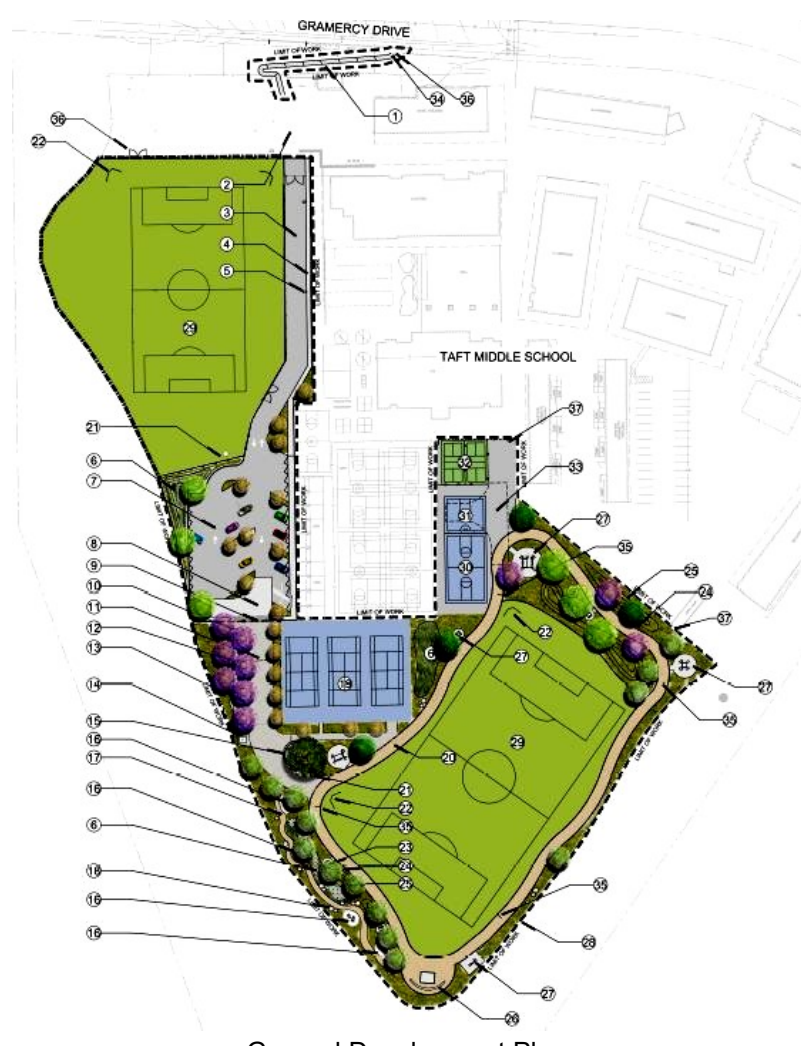
General Development Plan