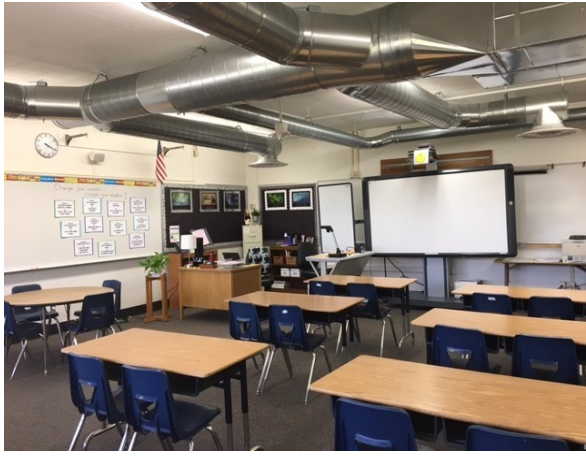
Updated classroom finishes and HVAC