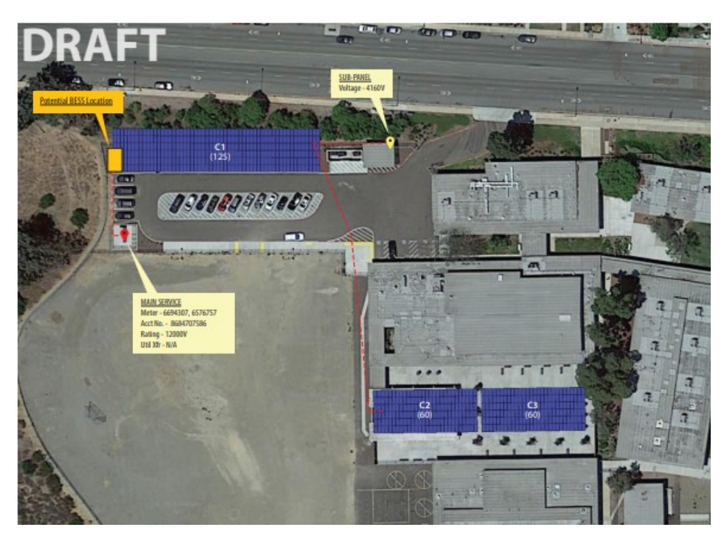
Proposed solar panel placement