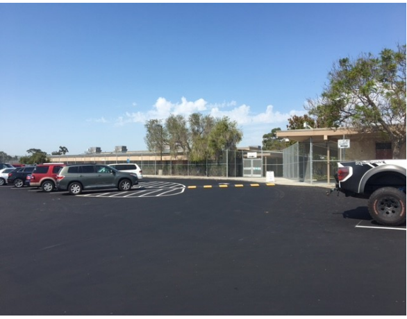
New paved parking lot