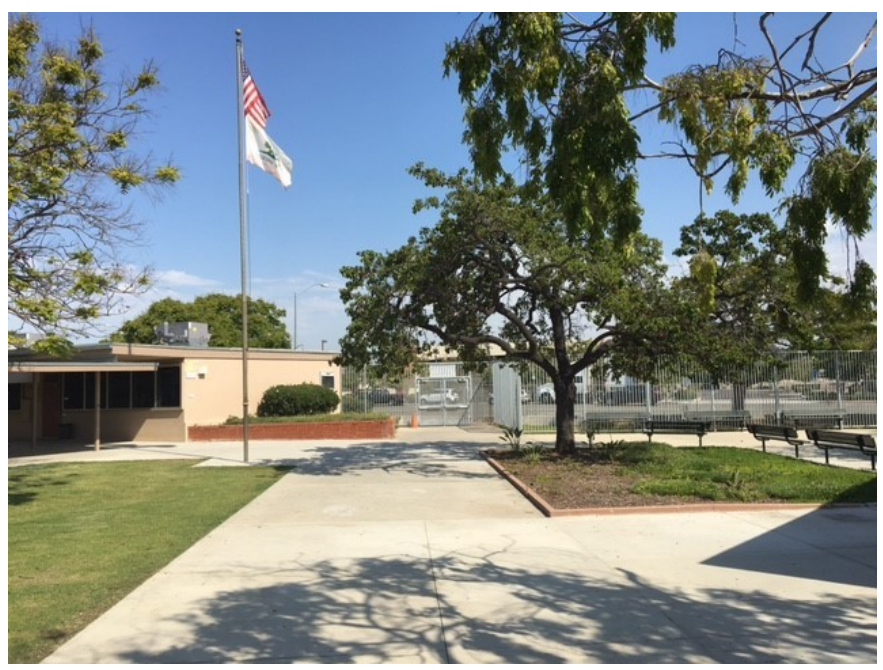
New ornamental fence