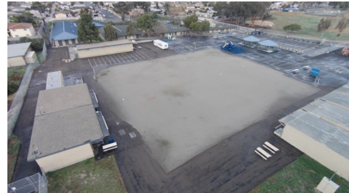
Pre-installation dirt field

The field features two soccer fields and a small scale Baseball diamond with permanent backstop, running track, and irrigation for cooling and cleaning purposes.