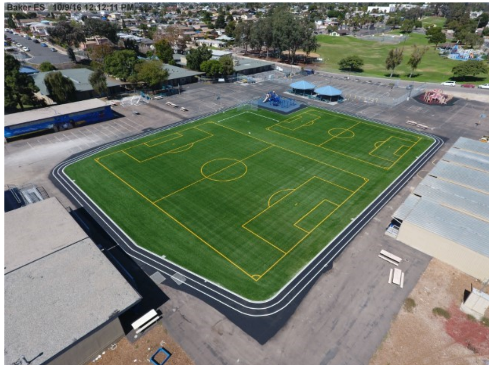
New turf play field with track