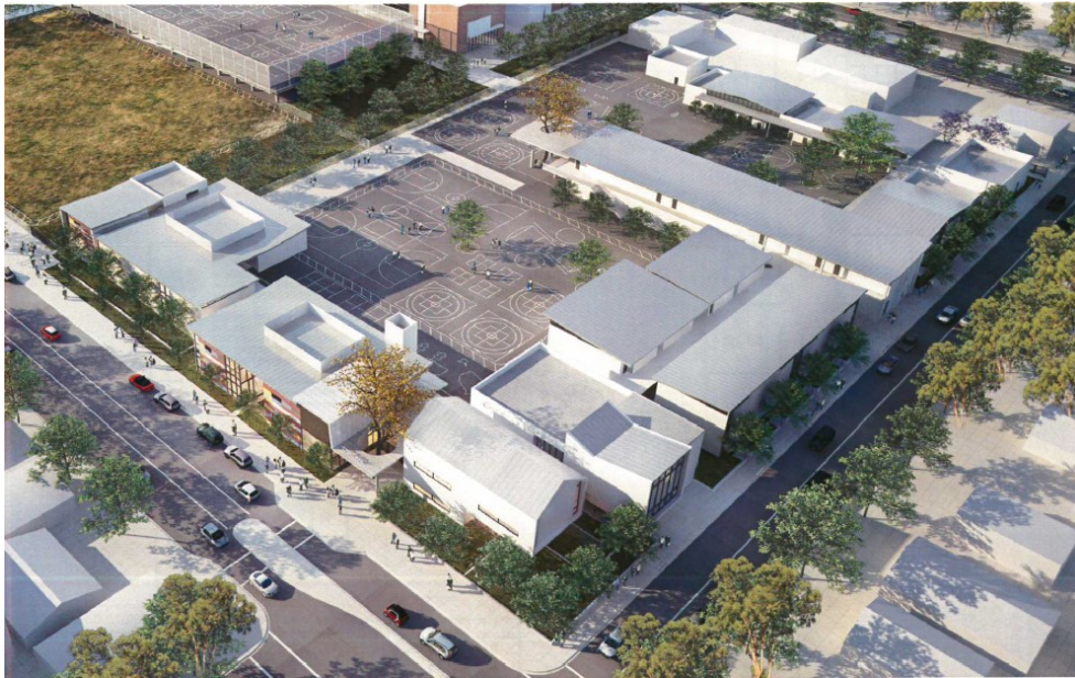
Aerial rendering of Central Elementary campus