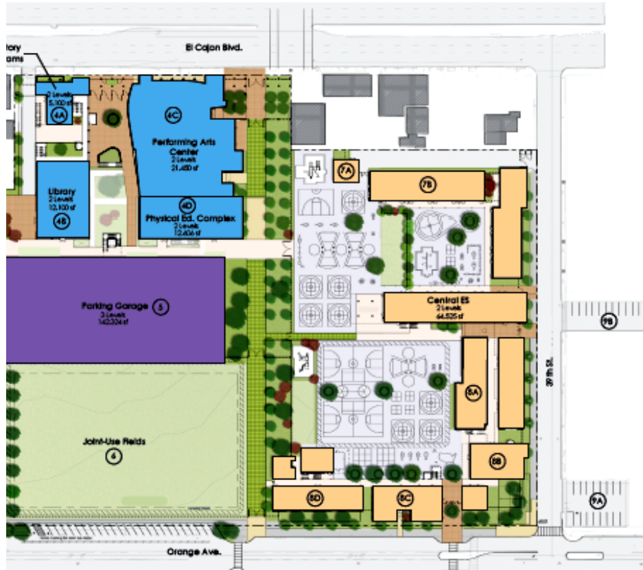
Pre-schematic Campus Plan

Construction Estimated Completion: Winter 2023