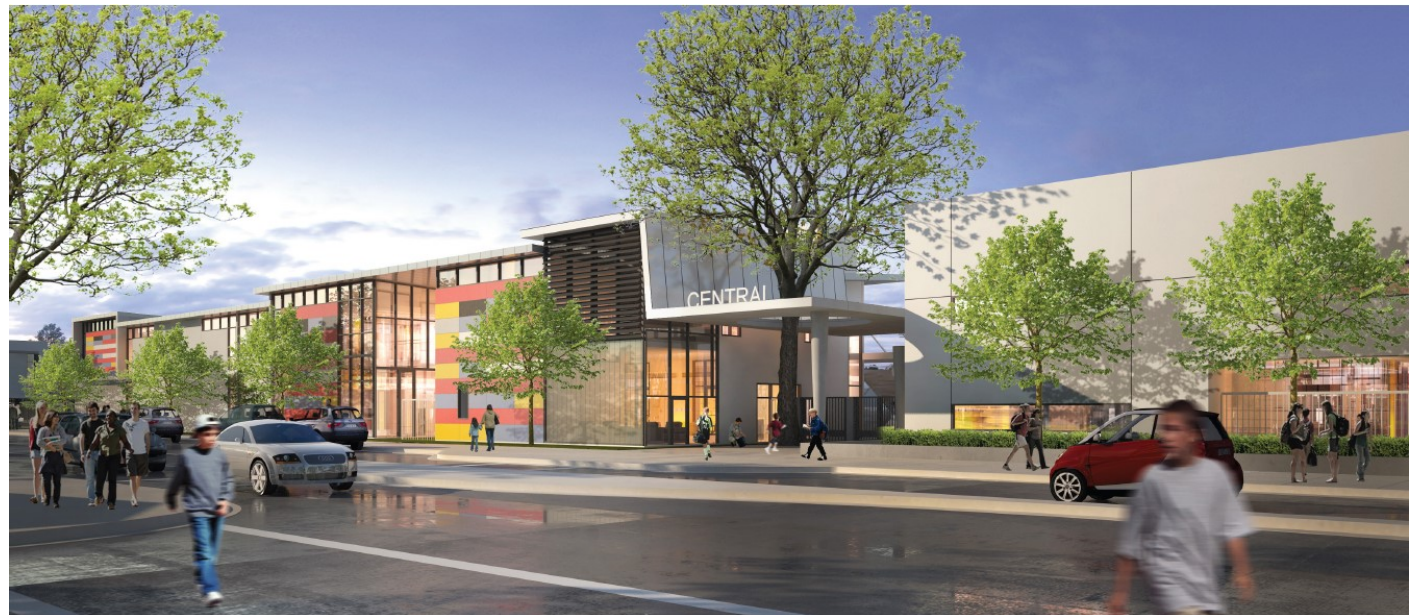
Rendering of Central Administrative Office and Entry