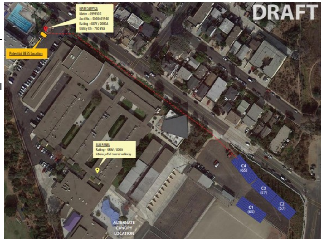
Proposed solar array placement