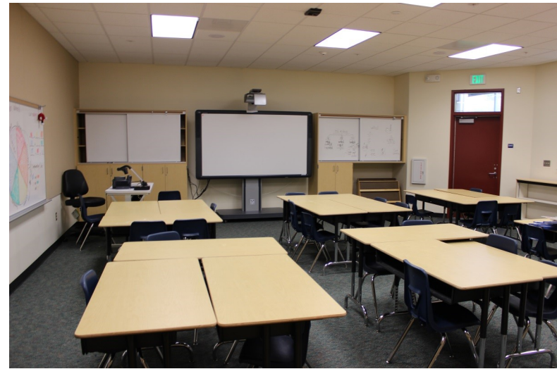
Classroom layout version two