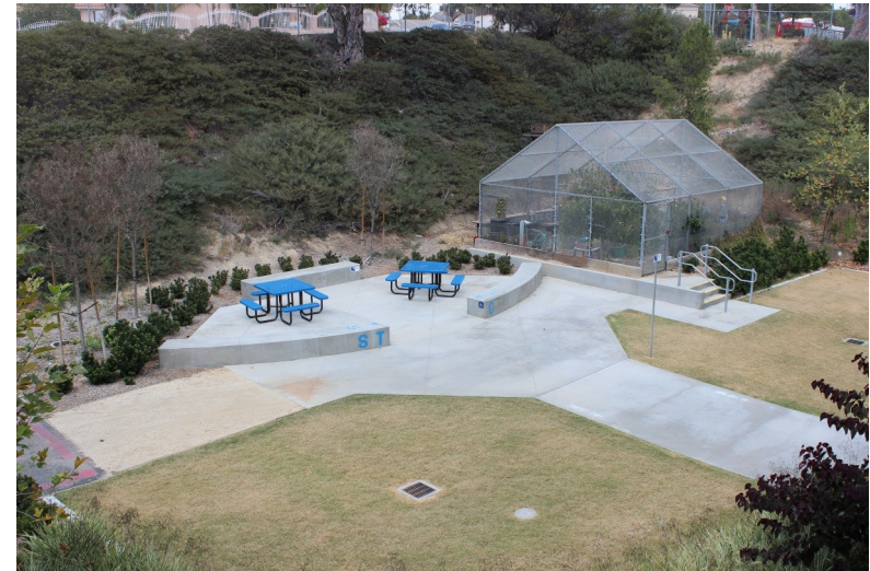
Garden enclosure and outdoor area