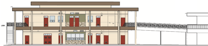
Western elevation rendering