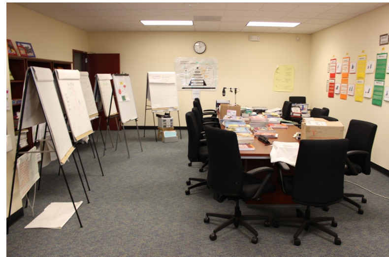
Teachers' conference room