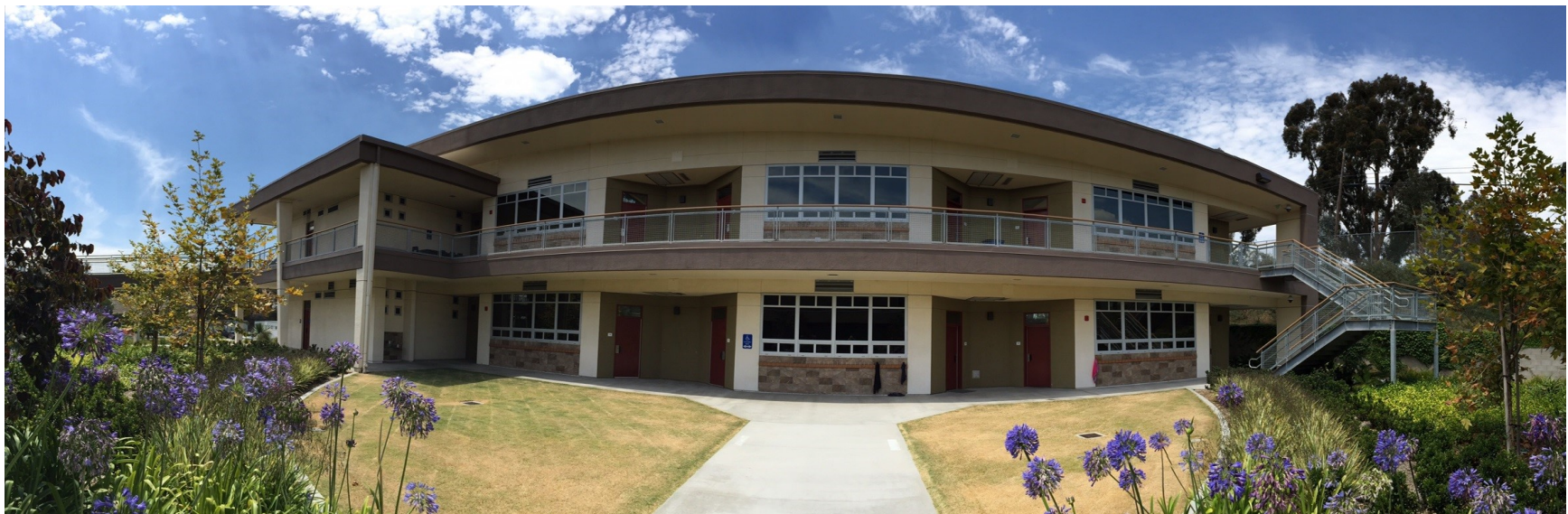
Southern elevation panorama