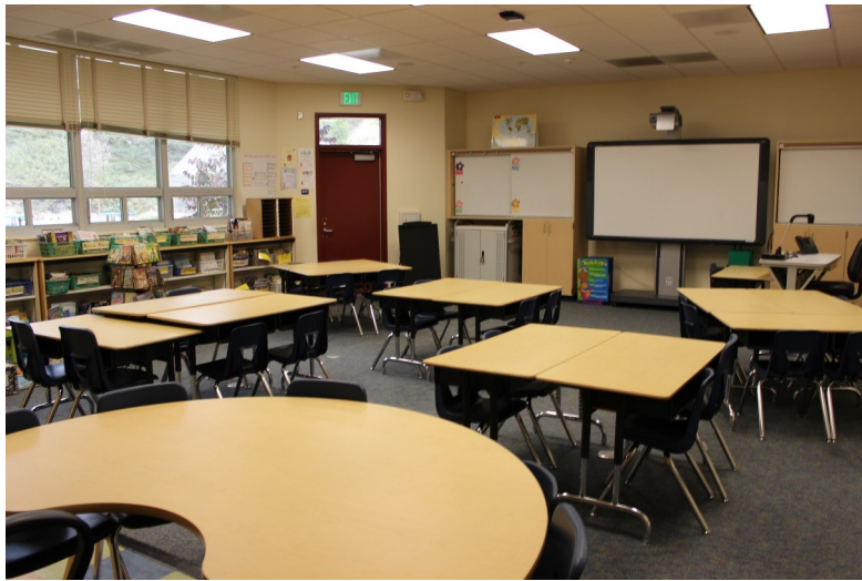
Classroom layout version one