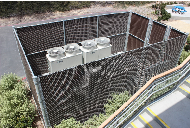
Air conditioning units