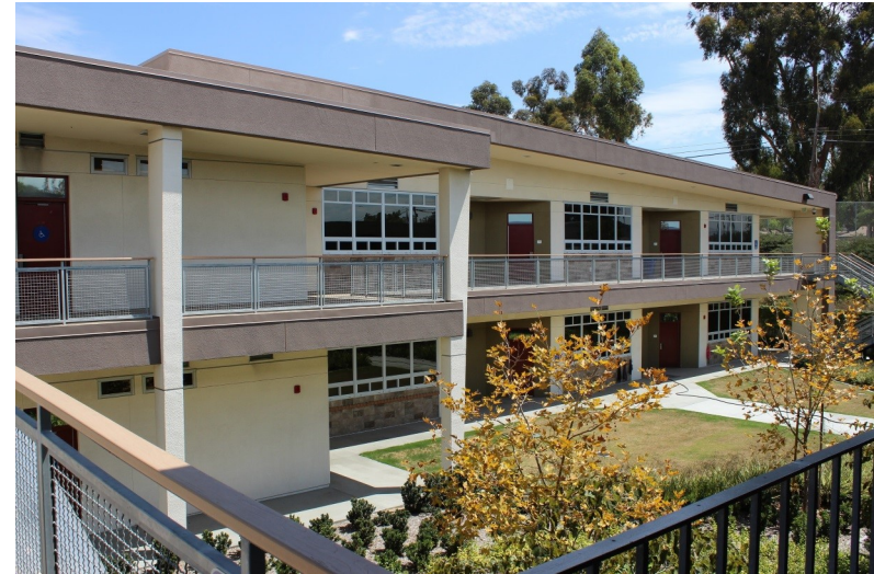
View from connecting bridge to building 100