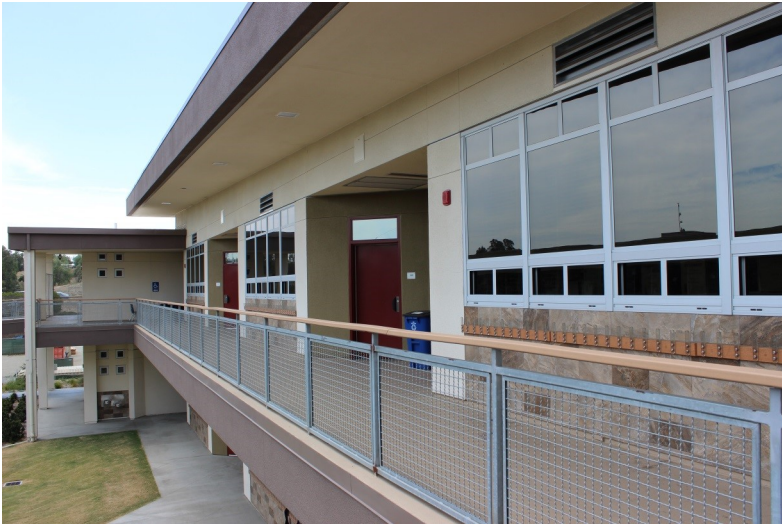
Second floor balcony, north facing