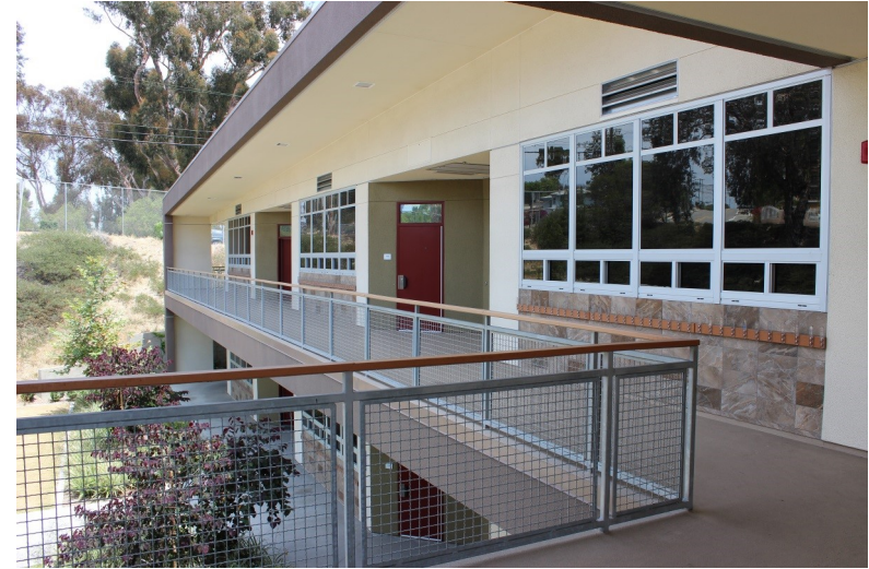
Second floor balcony, south facing