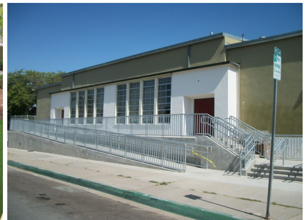
Renovated exterior spaces