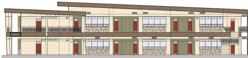
Southern elevation rendering