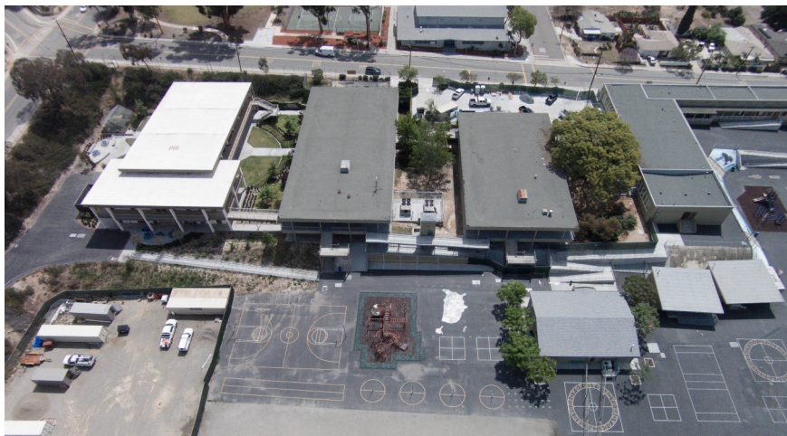
Aerial of new building location (far left)

Completed: August 2013 Funding: Proposition S