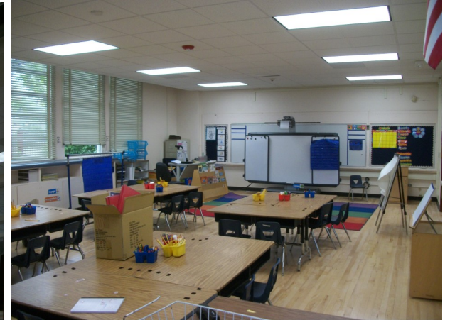
Renovated interior spaces