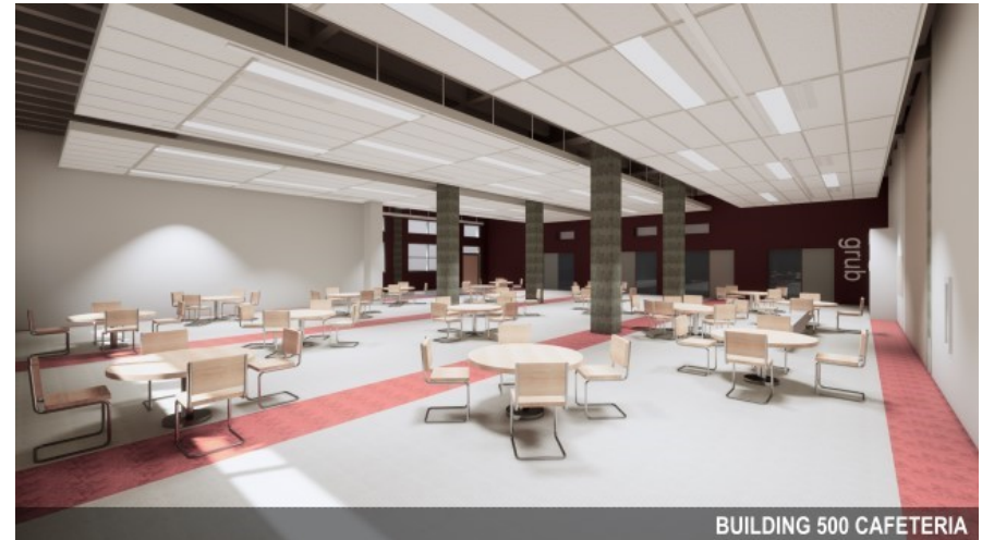
Interior Project Renderings