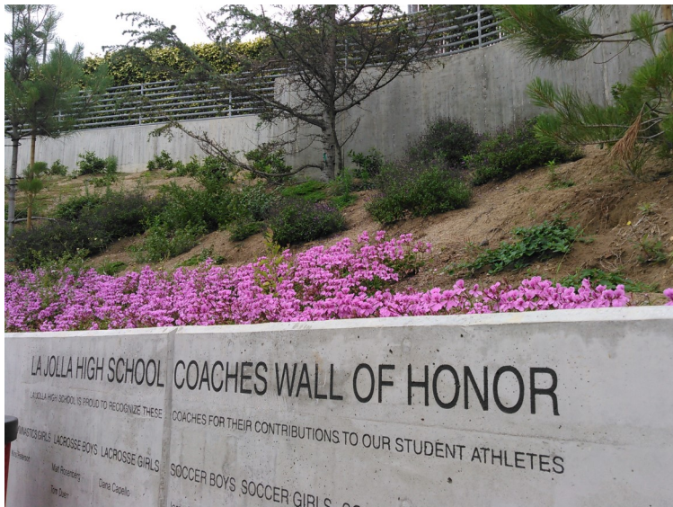
Coach Dedication wall with tiered landscaping and accessibility ramps