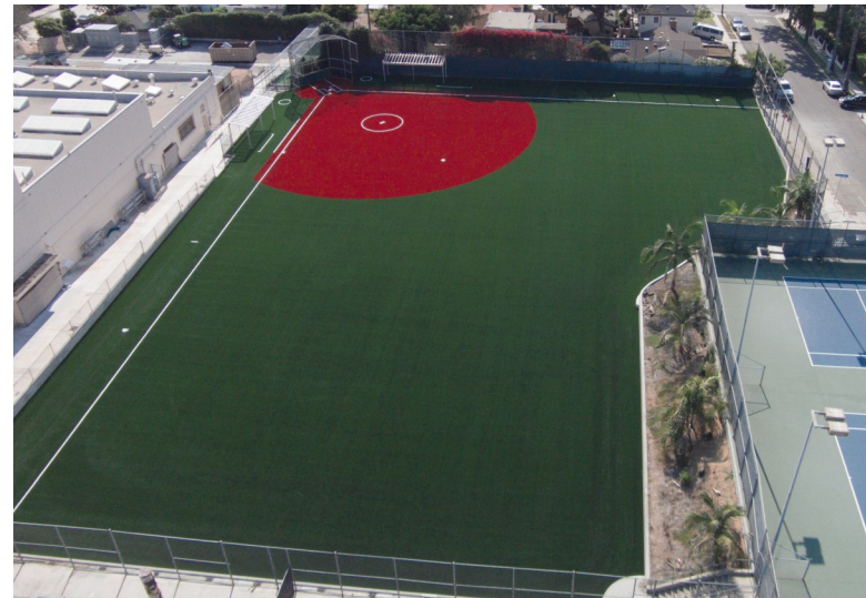
Aerial view of renovated softball field