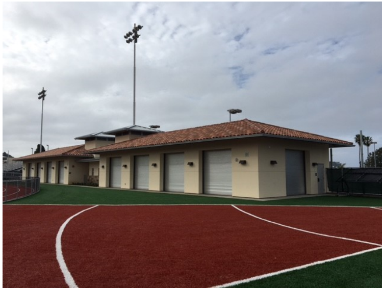
New stadium storage facilities