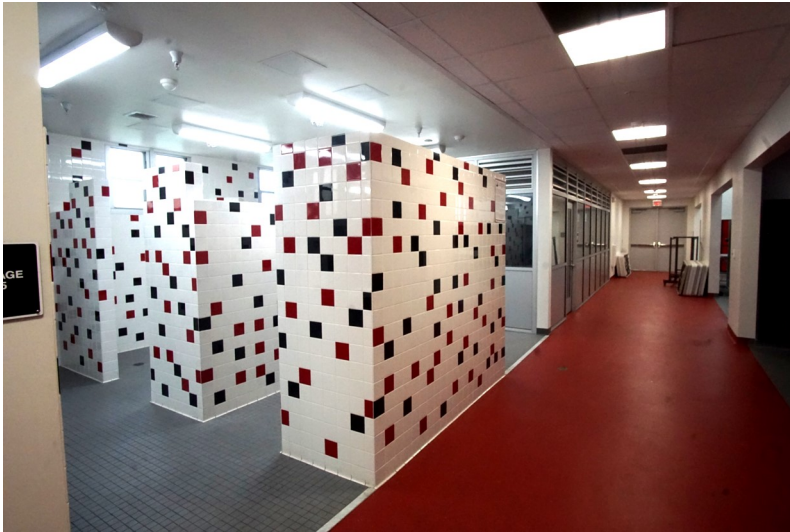
New Boys locker room facilities