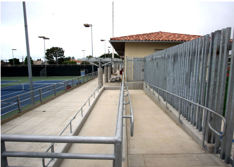
New accessibility ramps to tennis courts and new viewing area