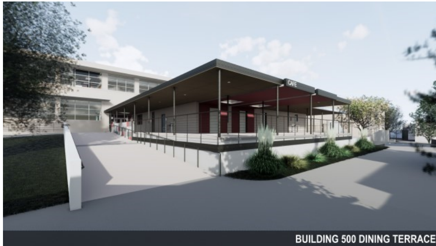
Exterior Project Renderings