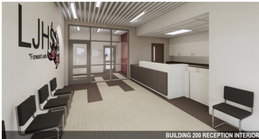
Interior Project Renderings