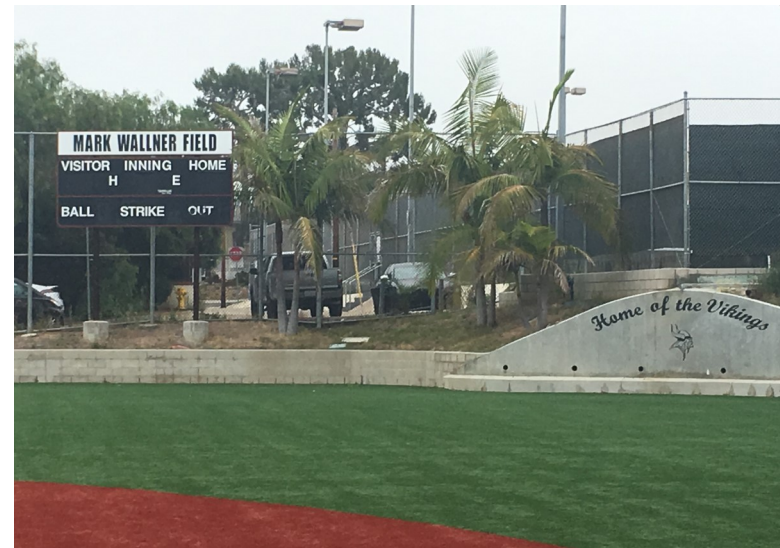
Added features to Softball Field