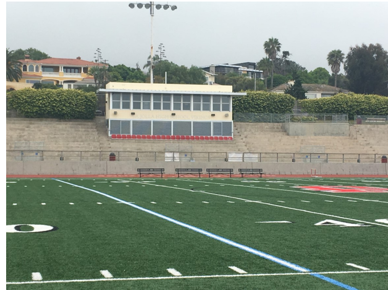
New Press Box