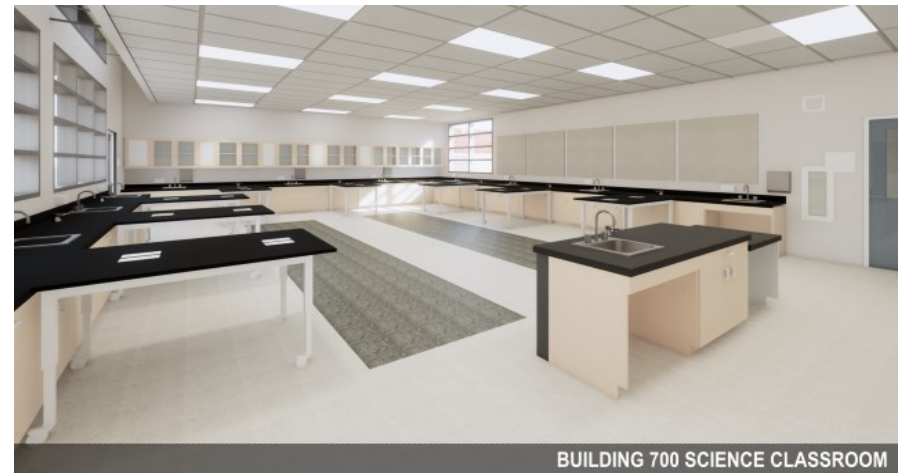
Interior Project Renderings