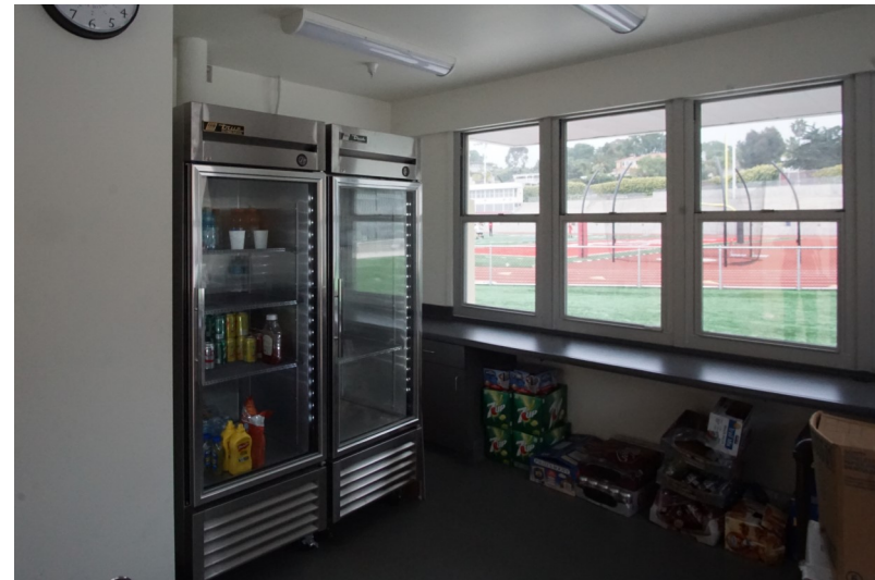
Interior view of new concessions