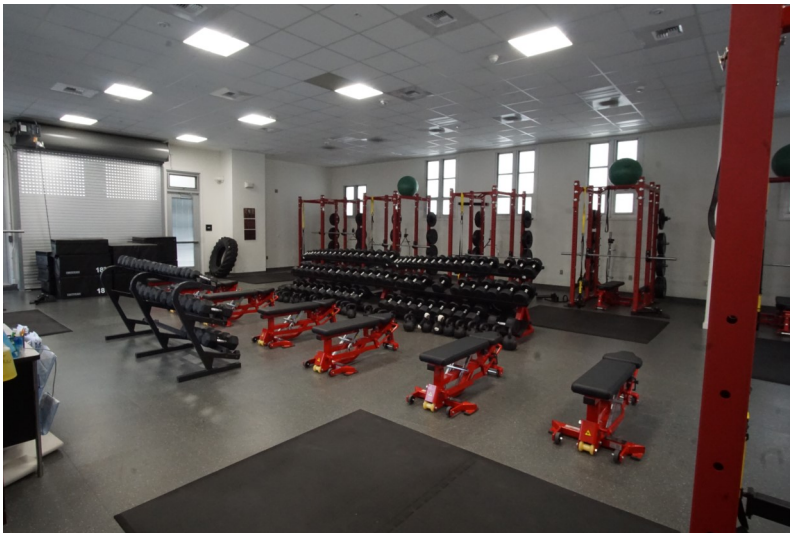
New weight room