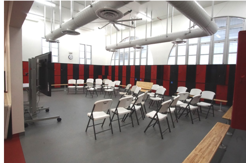
New varsity boys locker area