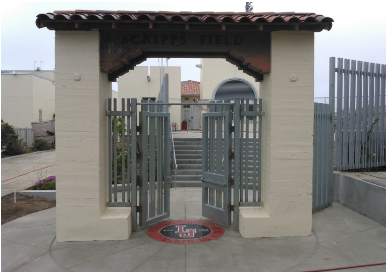
New security fencing at entrance