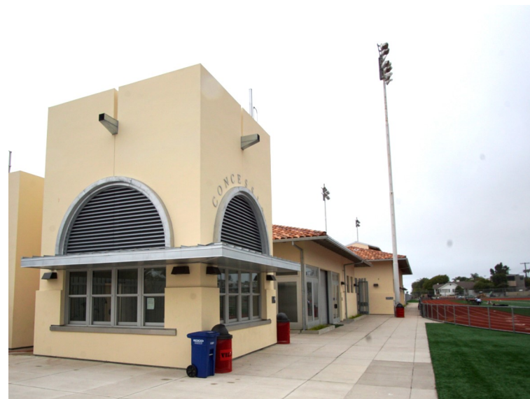
New visitor stadium entrance and concessions