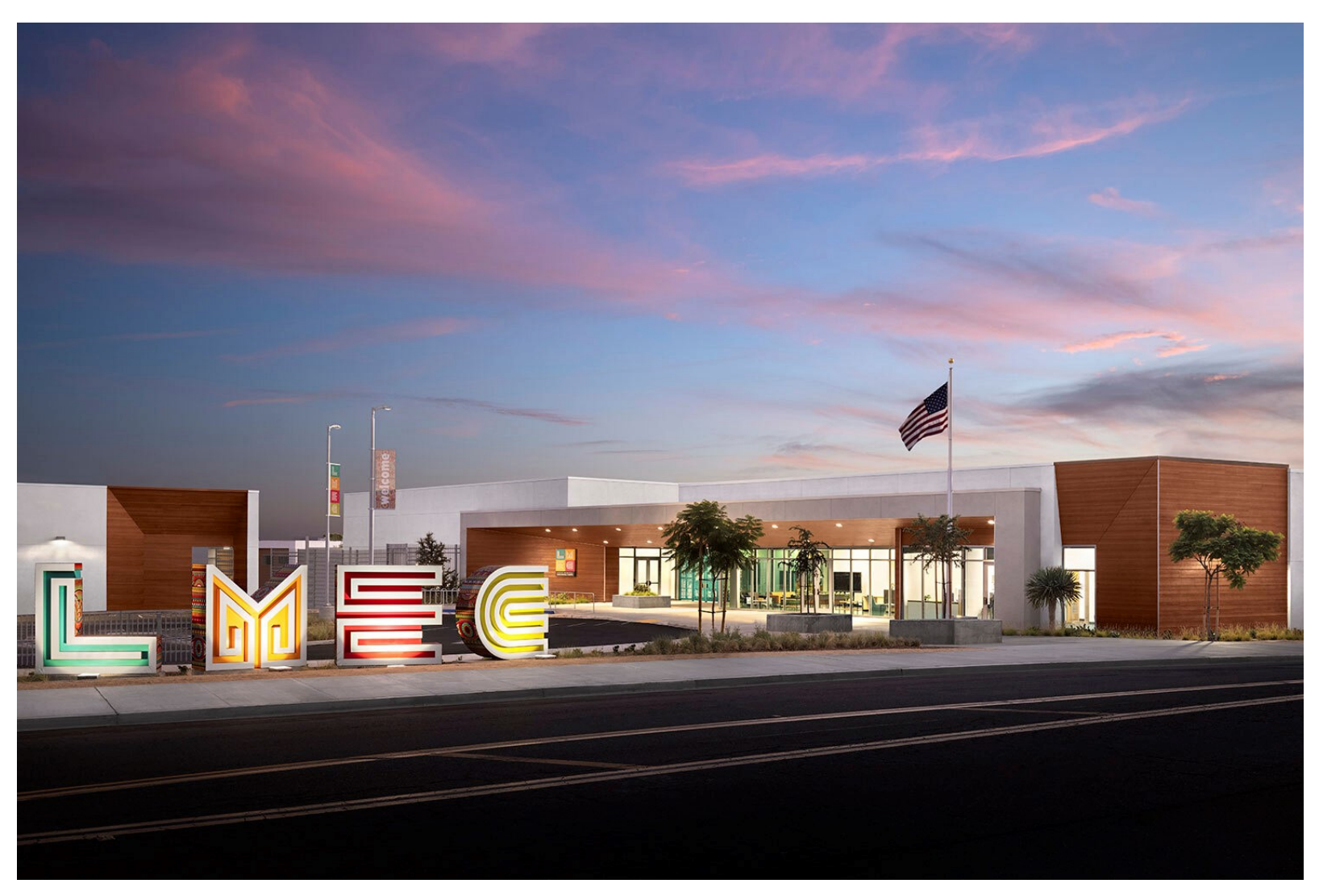
Front of Campus