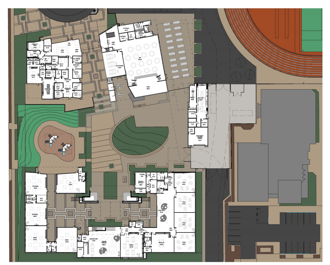
Conceptual floor plan for grades TK-6