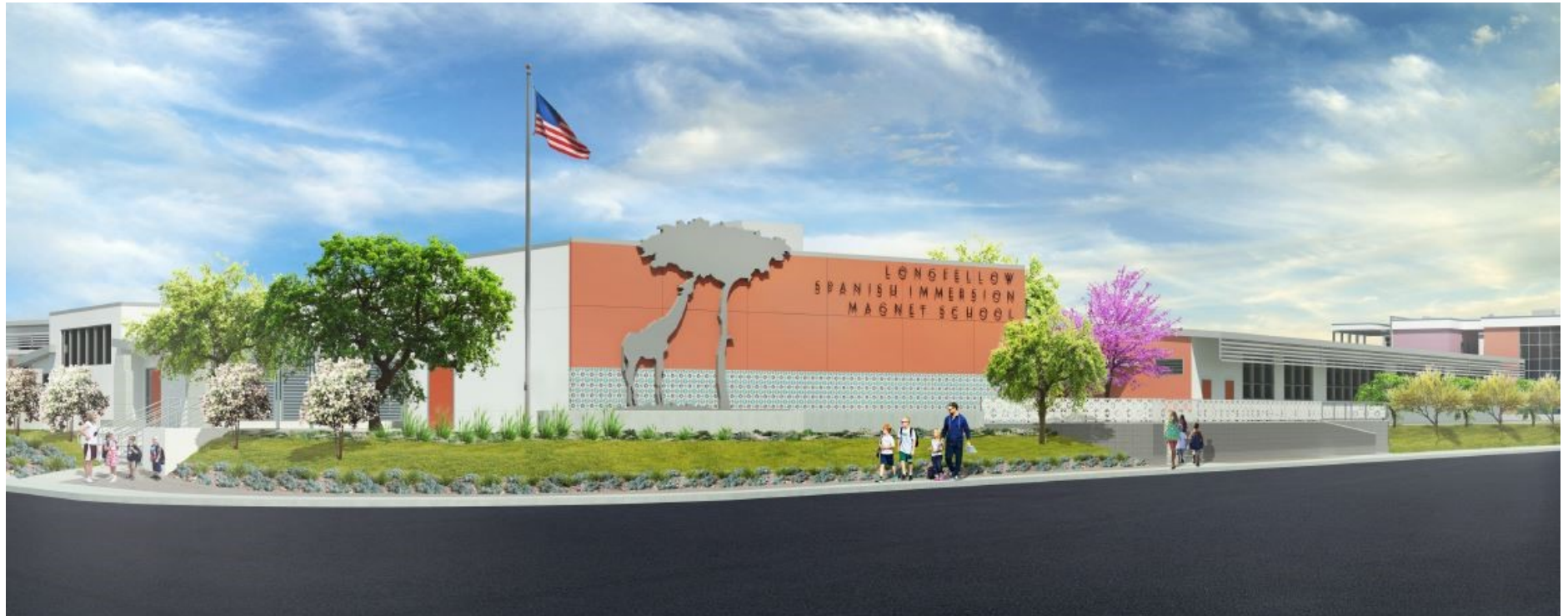
Rendering of New Campus Entry