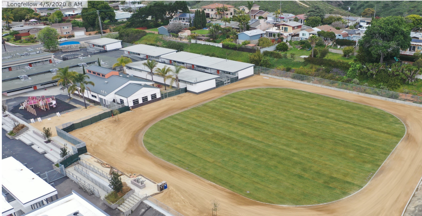
Joint Use Field