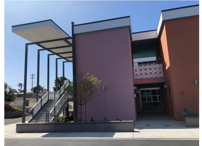
New Classroom Building