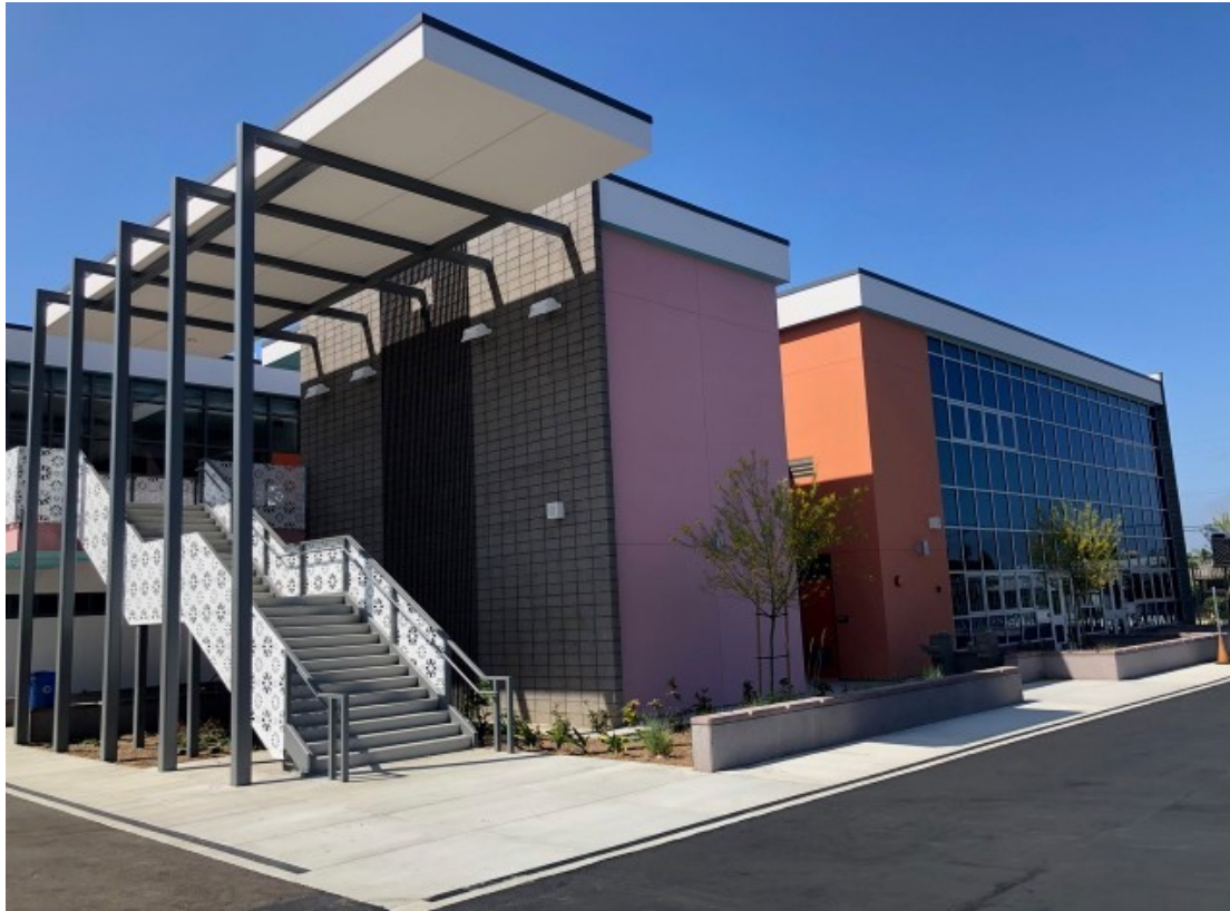
New Classroom Building