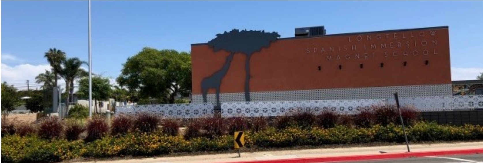
New Campus Entry