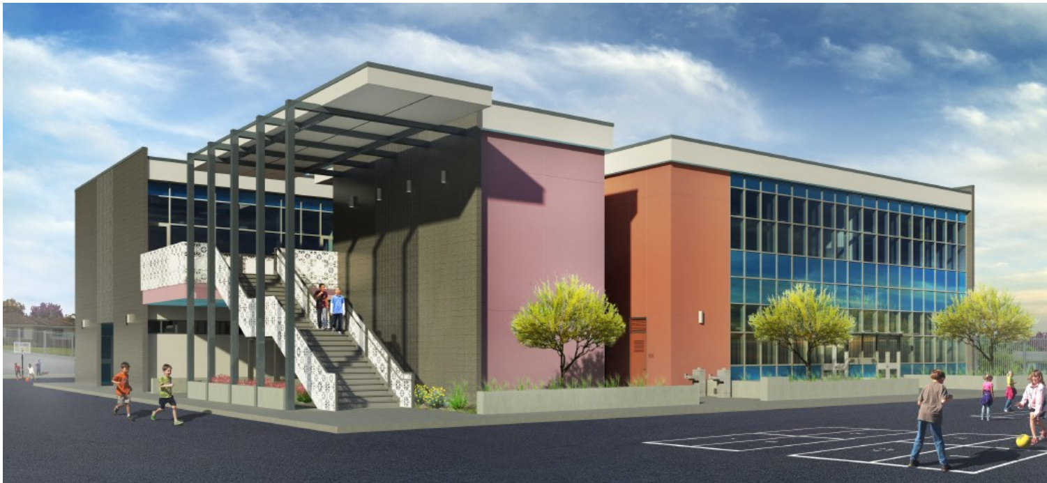
Rendering of new classroom building

multipurpose building will be expanded to include an approximately 1,600-square-foot music classroom with a moveable partition to provide flexibility. The entrance to the administration building will be upgraded to provide more visibility and safety for the school. The school will be repainted with vibrant colors.