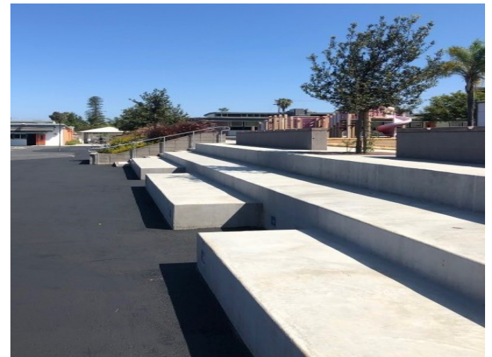
Central Stage Seating