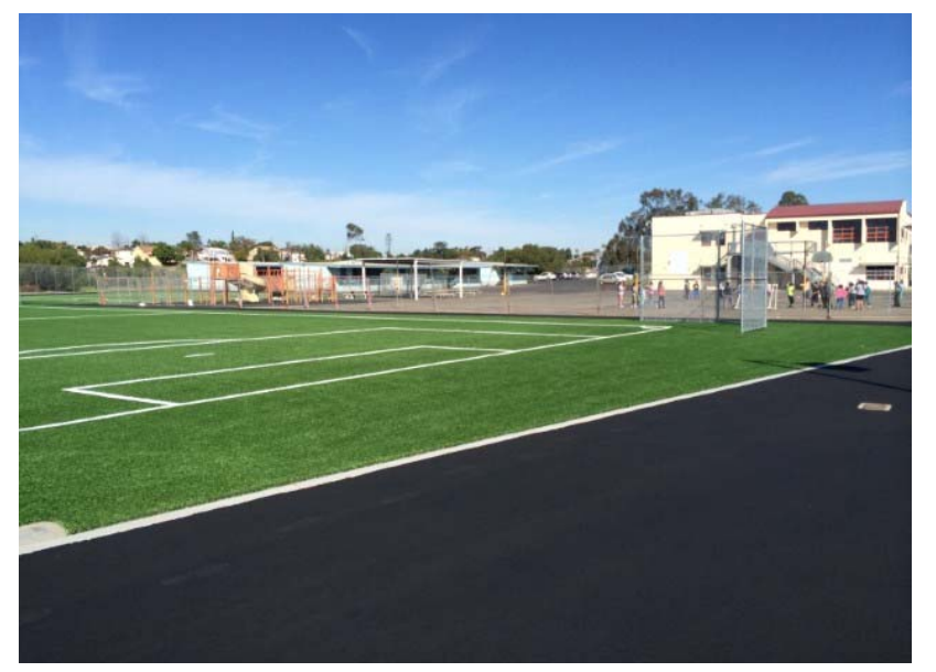
New synthetic turf field with track