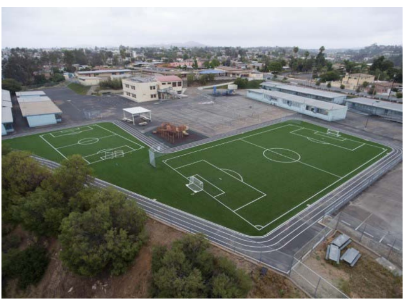
Aerial of new synthetic turf field