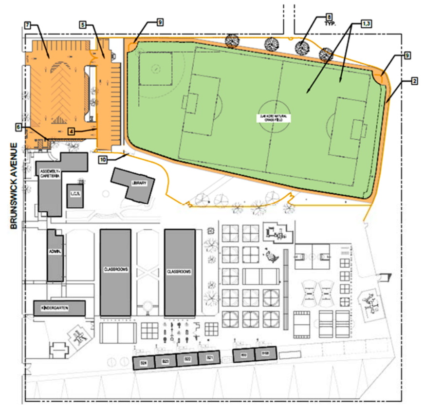
Site Plan for the new Joint Use Field