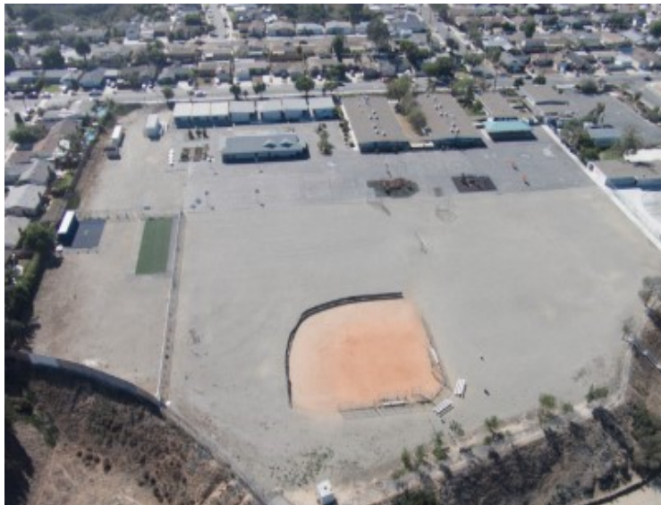
Dirt play field before installation