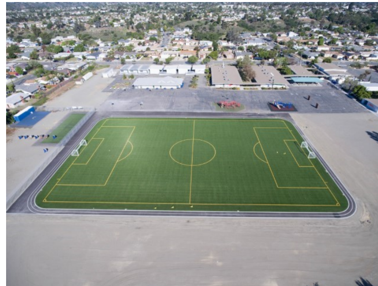
New synthetic turf field