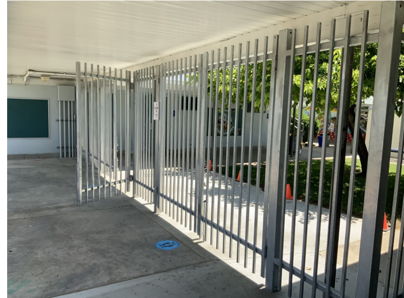
Main Entry Fencing