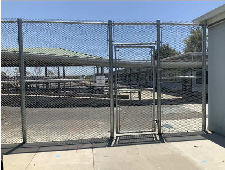
Kindergarten Fencing Entry