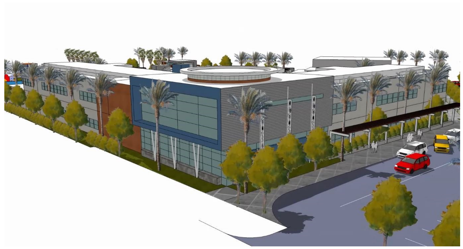
New Classroom Building Rendering