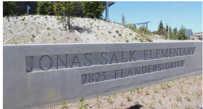
Concrete sign at intersection of Flanders Dr. and Parkdale Ave.