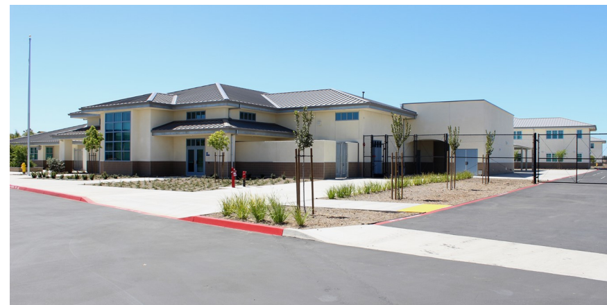
Front of school