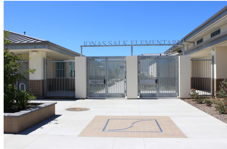
Entry gates with custom metal lettering