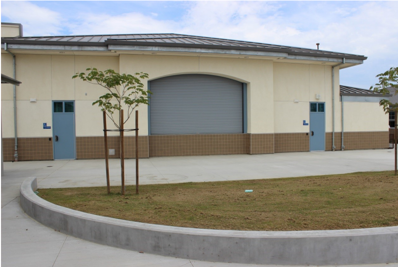
Outdoor stage area connected to multi-purpose facility