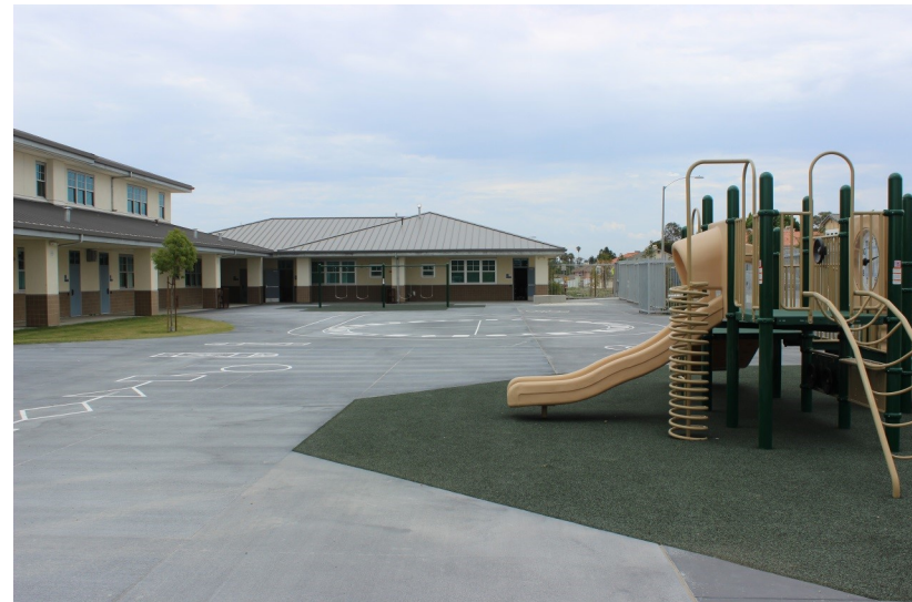
Kindergarten play area