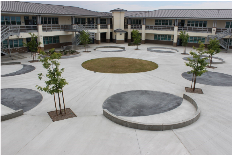
Courtyard with decorative lunar cycle and elevator tower