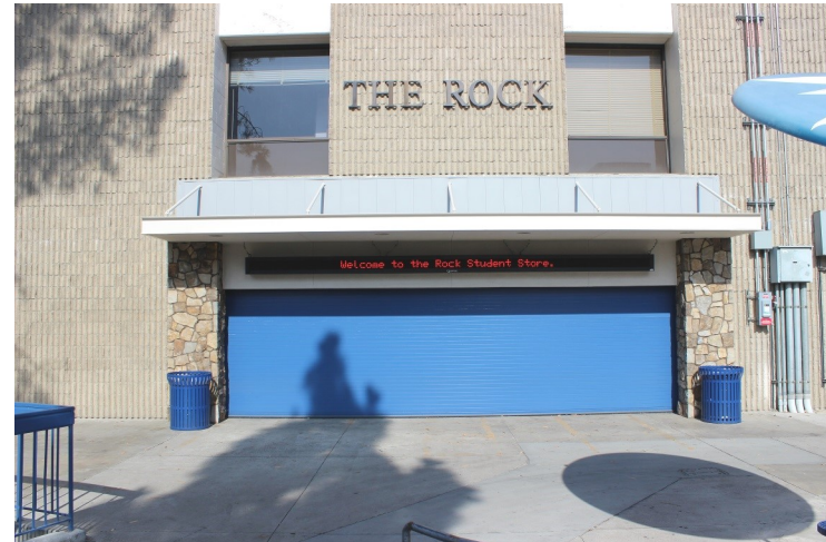
The Rock student store exterior