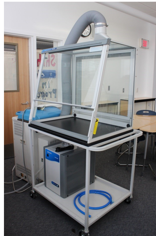
Portable fume hood