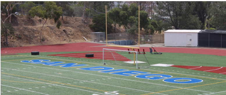
Southern endzone and shot put areas

San Diego High's existing dirt track and natural grass field were replaced with an all-weather rubberized track and synthetic turf field that supports football, lacrosse, field hockey, and soccer. Additional improvements included grading and field drainage. The field was upgraded in 2014 as part of a warranty replacement and now features the school's updated Cavers logo at midfield.