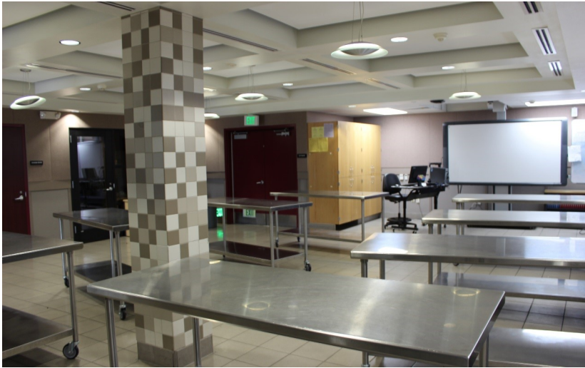
Preparation area/classroom and instructor lecture area