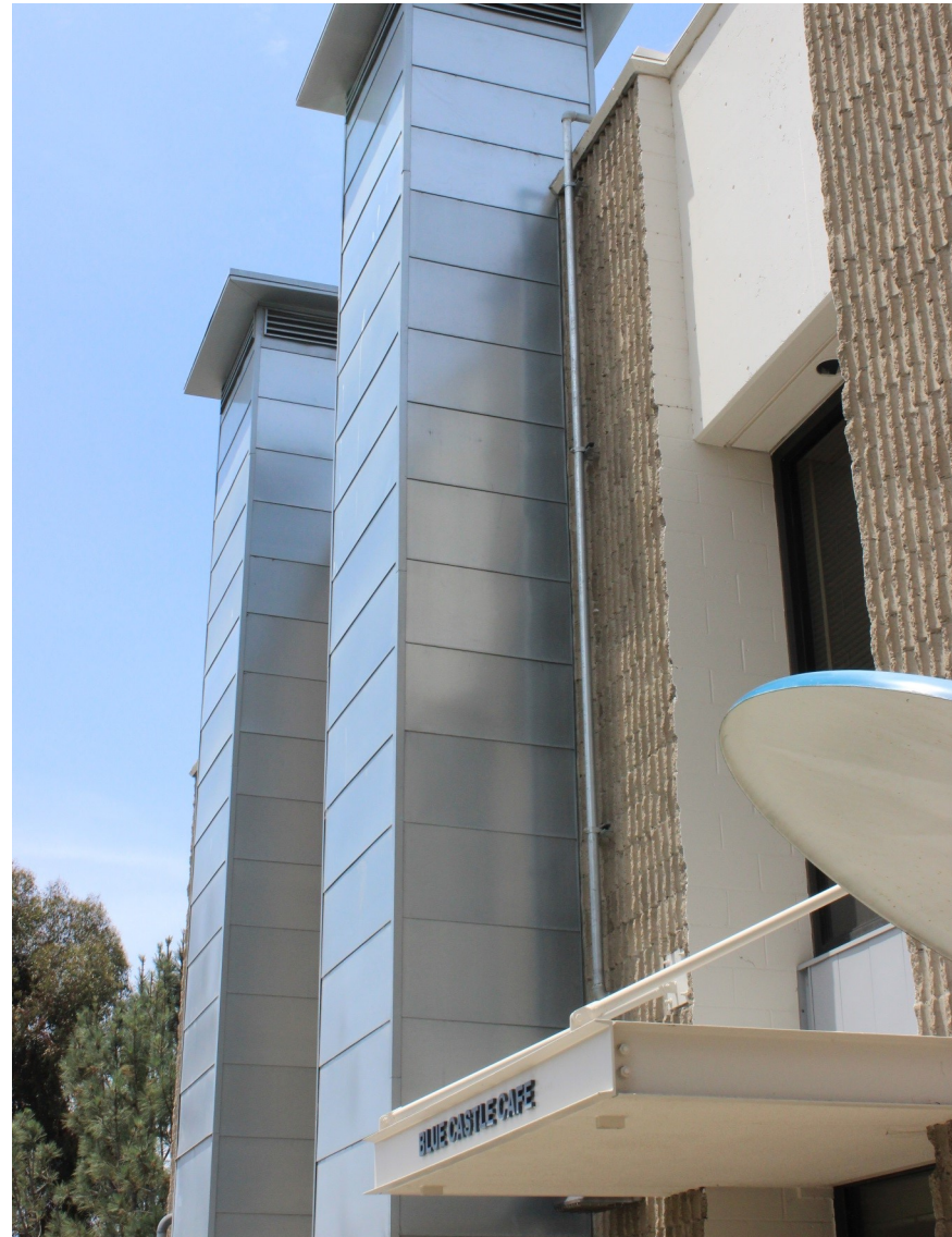
Culinary arts entrance and stainless steel vents