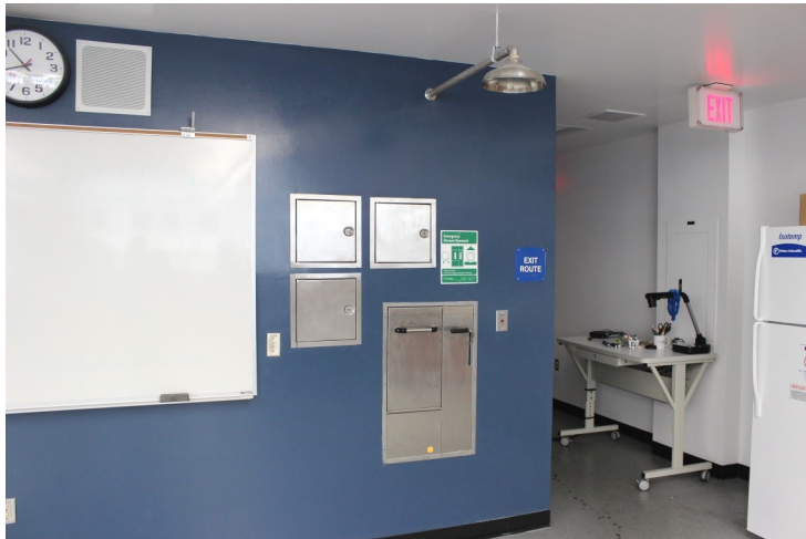
Emergency lab shower