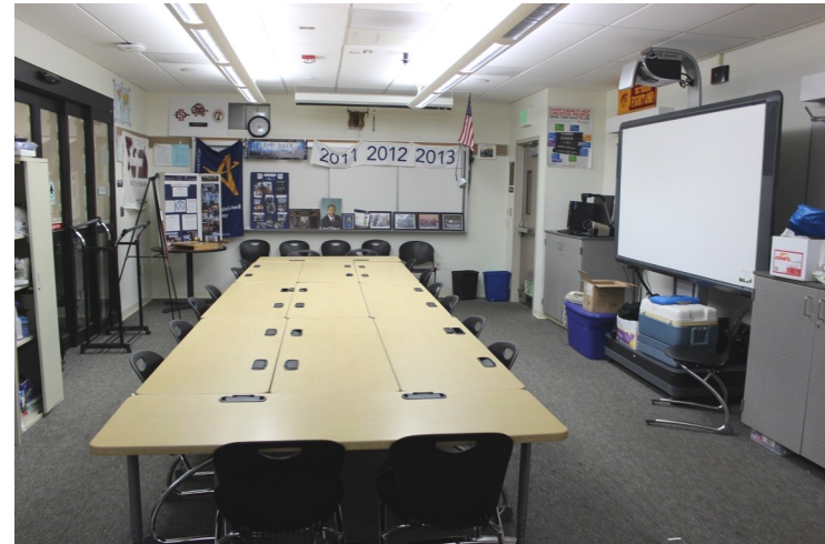
One of two classrooms