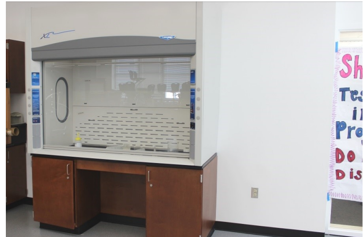
Laboratory fume hood