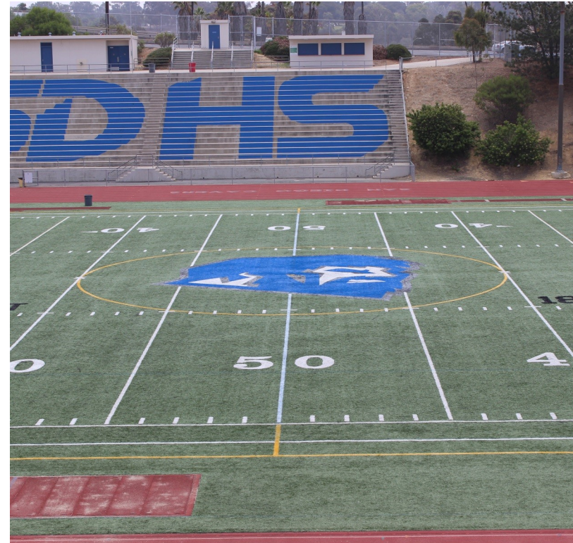
Updated San Diego High logo now featured at midfield