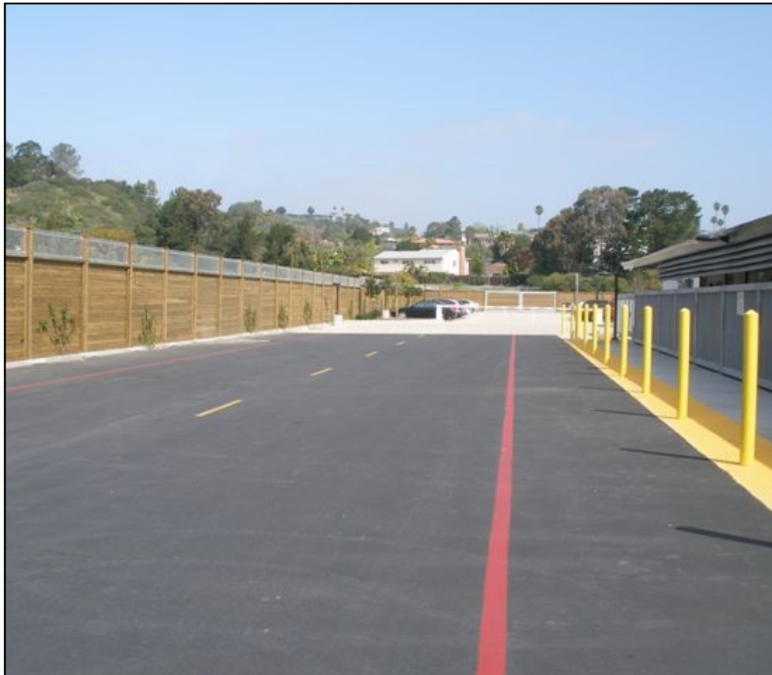
Completed drop-off and pick-up zone