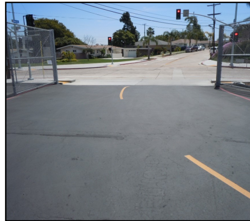
Beryl street driveway intersection