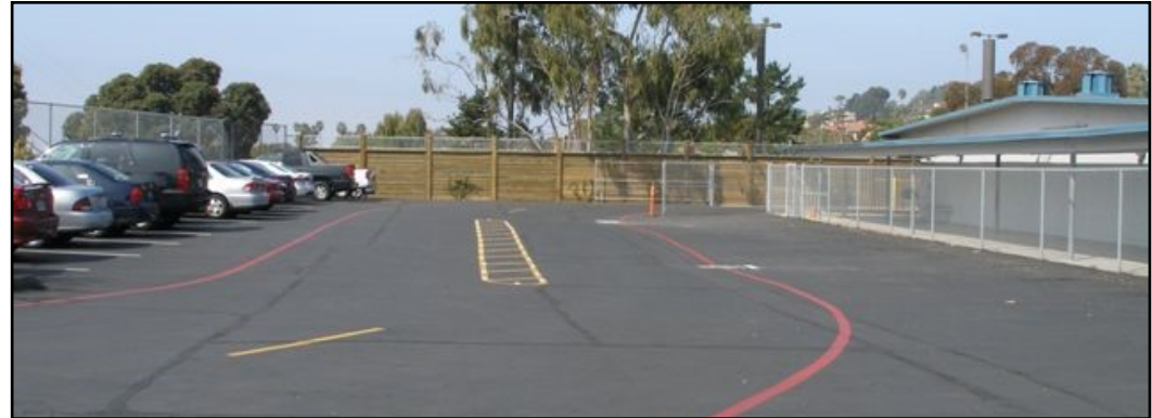
Entrance and parking