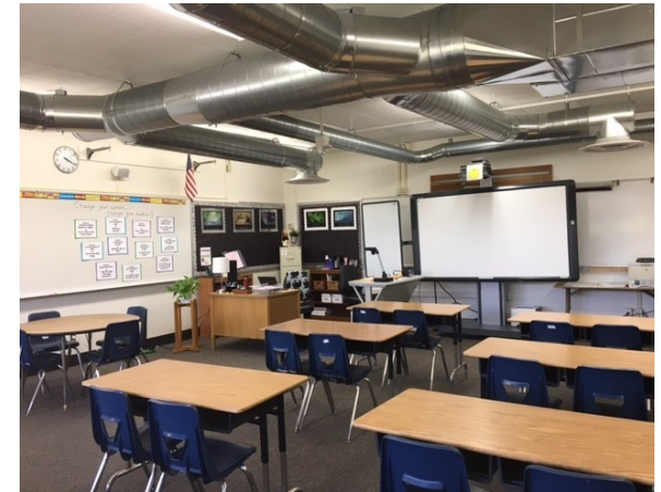
Updated classroom finishes and HVAC