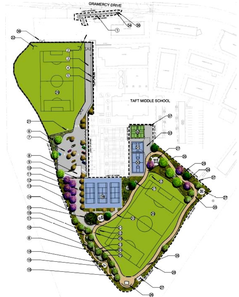
General Development Plan