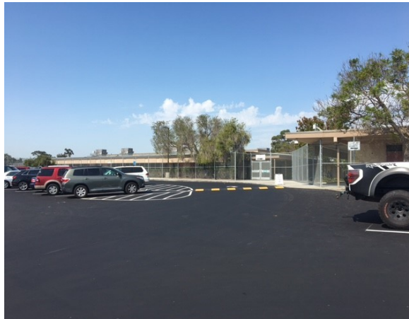
New paved parking lot