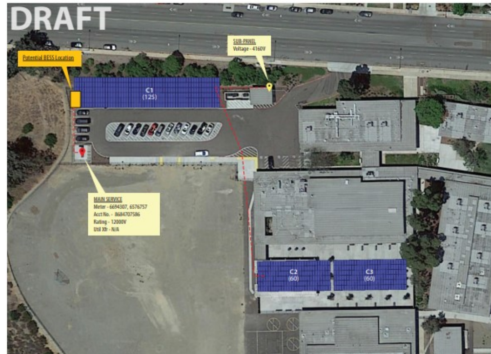
Proposed solar panel placement