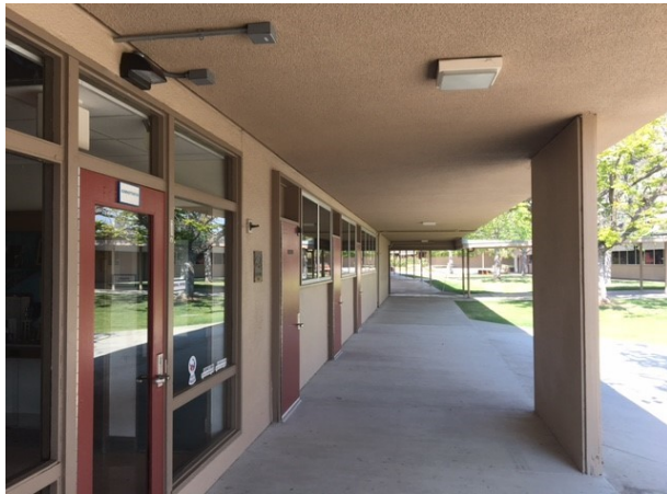
Updated exterior finishes