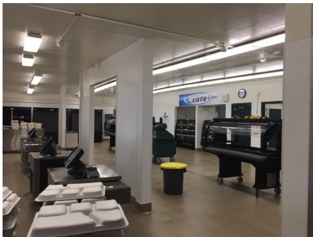
Updated food services equipment