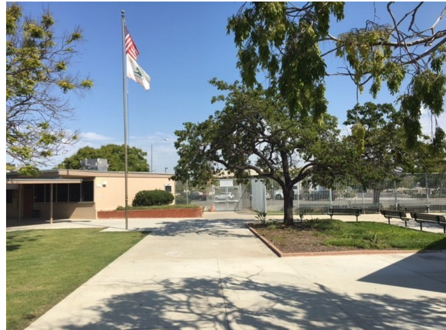
New ornamental fence