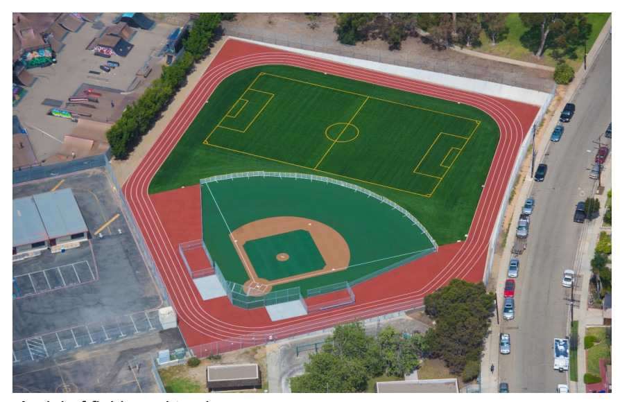
Aerial of fields and track