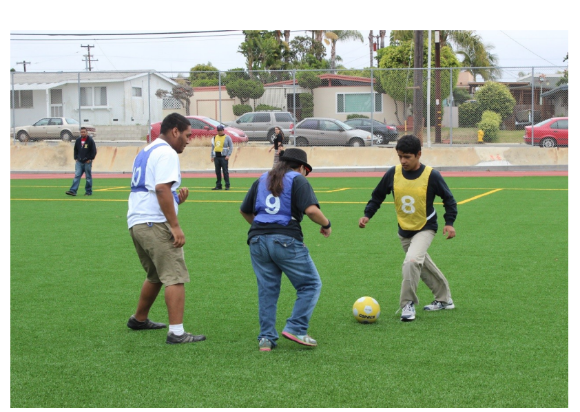
Students playing soccer on the adjoining turf field

A .6-acre, multi-use synthetic turf field and 37,000 square feet of permeable rubberized running track were constructed at Whittier School. The field features fencing, a turf baseball diamond, backstop, dugouts, benches, and an approximately 162' x 92' area with a designated soccer field. The track sits on top of porous asphalt pavement and includes four marked running lanes. Irrigation and drainage were also installed.