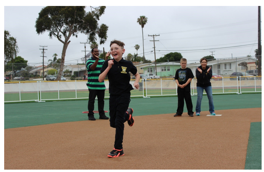
Student running the base path of the turf baseball diamond